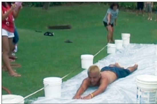
Fig. 4. A student completes his slide with water for the Slip 'N Slide Friction Lab.

etc.). Students assigned the slider role then slide without water, with water, and with water and soap. We used a very slick tarp as our Slip 'N Slide, so there were no safety issues with sliding without water; however, depending on the type of tarp you use it may be wise to have the sliders wear t-shirts to protect their stomachs as they slide or slide on their bottoms. The timer records the time of the slide, and the distance measurer records the distance of the slide. These data are then used with the slider's mass to calculate the coefficient of friction for each surface.