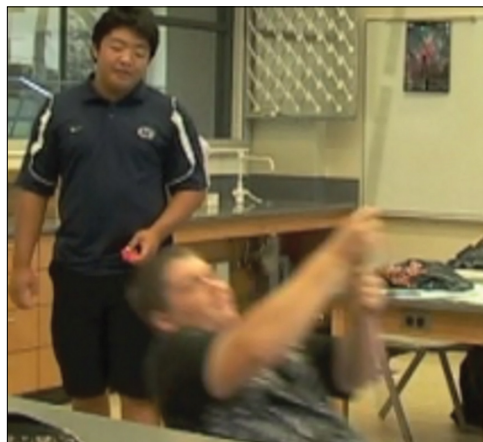
Fig. 1. Students swinging in Human Pendulum Lab.

The objective of this lab is for students to determine whether the period of a pendulum depends on different properties of a pendulum (Fig. 1). Students begin by observing a simple pendulum, making observations, and brainstorming what factors are measurable and may be affecting the period of a pendulum. Students then develop their own questions for investigation and create hypotheses for the questions they develop. They then collect data, using rope swings hung from the ceiling in the classroom and themselves as the bob of the pendulum. Depending on their question, students measure and record the length of the pendulum using a measuring tape, record the angle of the pendulum using protractors, time the period using stopwatches, and measure the mass of the “bob” using bathroom scales.