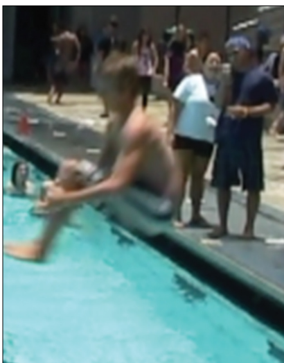
Fig. 2. Students create their cannonball videos at the pool.

Helping students understand how projectile motion can be broken down into the x - and y -direction can be a very abstract and difficult concept. The objective of this lab is for students to analyze the video of a human projectile to help them understand how the position-versus-time and velocity-versus-time graphs differ in the x - and y -direction for a projectile. This is a confirmatory lab and asks students to videotape at least one student per group doing a cannonball into the swimming pool (Fig. 2). Groups then analyze this video using Logger Pro and determine how the motions differ for the human