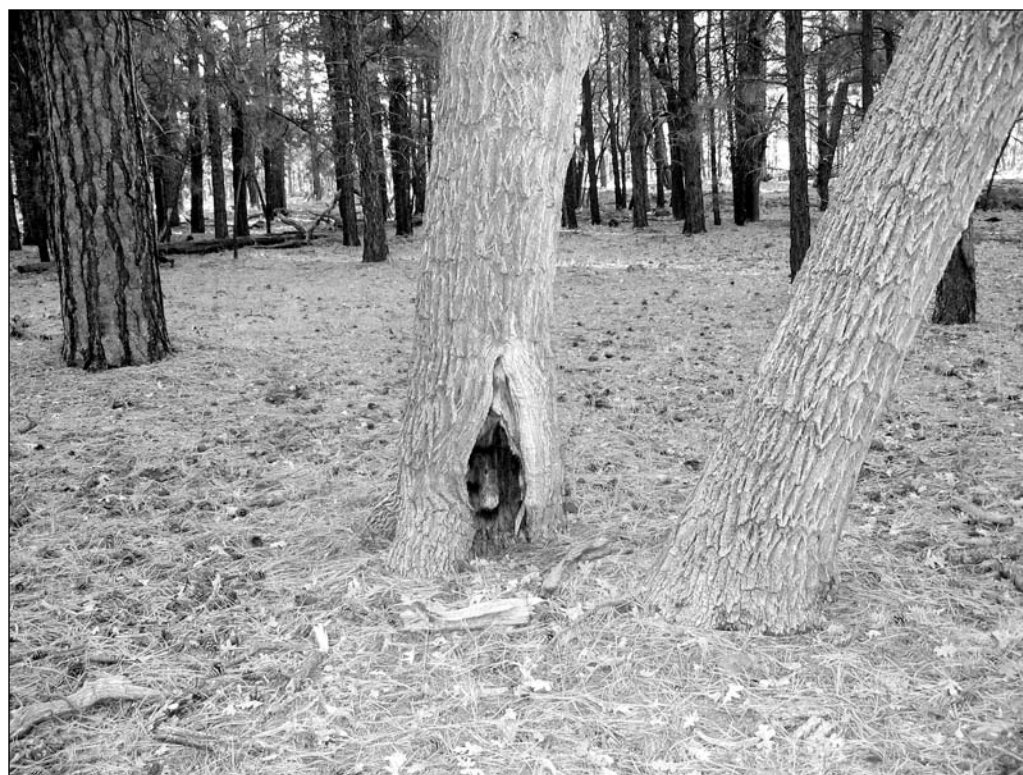
Figure 1 —Charred bole on a Gambel oak, possibly reflecting the historical occurrence of frequent surface fires in southwestern ponderosa pine-Gambel oak forests. This site had no known history of fire after the last presettlement fire in about 1883 based on nearby research (Fulé and others 1997). Photo taken 6 miles (10 km) southwest of Flagstaff, Arizona, in the Northern Arizona University Centennial Forest. Photo by S.R. Abella, October 21, 2005.

In addition to some ability of large Gambel oaks to survive low-intensity fire, oaks top-killed by fire usually resprout (Harrington 1985, Kunzler and Harper 1980). Gambel oak is thus both a resister and an endurer of fire, following Rowe's (1983) classification of plant adaptations to fire. Large oaks develop some ability to survive (resist) fire, while stems top-killed by fire resprout (endure).