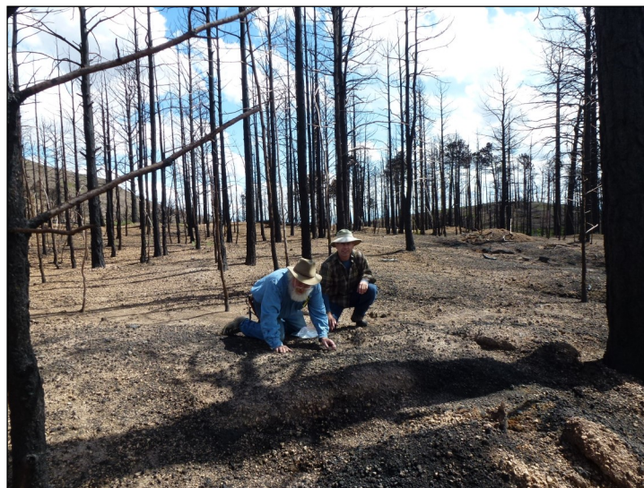
Figure 1. Wind driven crown fires consume surface detritus, needles and fine branches but leave heavier woody fuels intact. Above, the Las Conchas Fire incinerated more than 30,000 acres of timber in a single burning period near Cochiti Mesa, Santa Fe National Forest, in summer 2011.

As ecosystems are replaced following high severity disturbances, the new systems that reestablish in a warmer climate may not resemble those that developed during the cooler and wetter 19th and 20th centuries. Existing biome locations are predicted to synchronously move north or up in elevation to maintain viability in their climate envelope (Figure 2, p. 2).