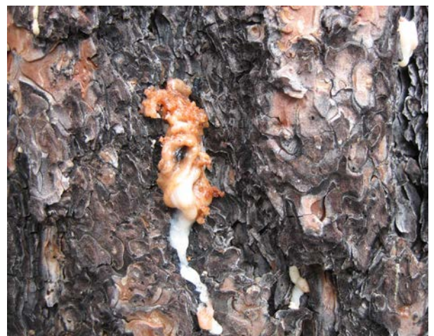
Figure 1: Pitch tube and frass in bark crevices on a ponderosa pine tree.

temperature will likely have a direct impact on the beetle itself whereas water stress (exacerbated by increased temperatures and periods of drought) will indirectly impact the beetle via impacts on the host trees (Bentz et al. 2010).