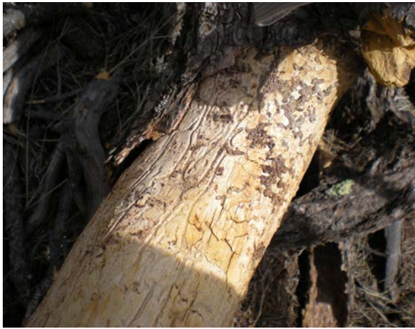
Figure 2: Bark beetle galleries.