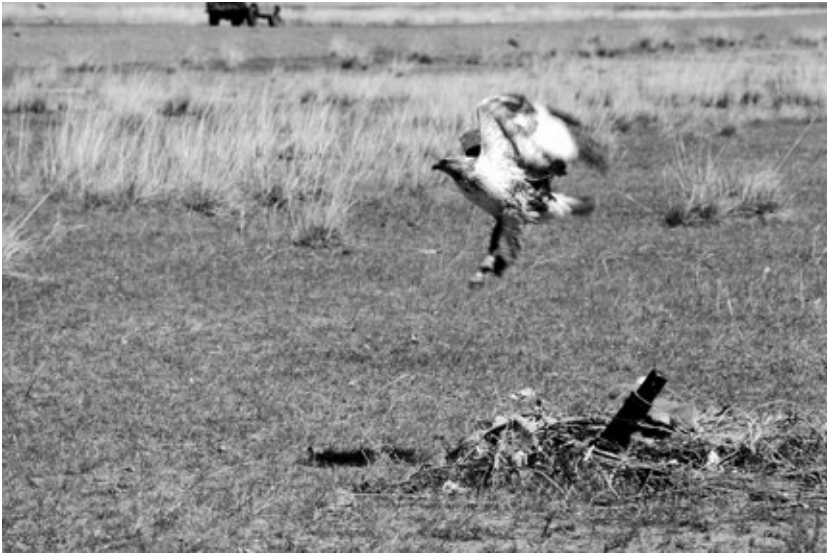
Figure 3. This Upland Buzzard nest (central Mongolia, 26 May 1995) is located at the base of a steel rod emerging from the ground.

nestlings follow the daily path of the pole's shadow. The need for shade also explains the placement of Lanner Falcon ( F. biarmicus ) eyries amid metal rubbish on the open Sahara Desert (Goodman and Haynes 1989).