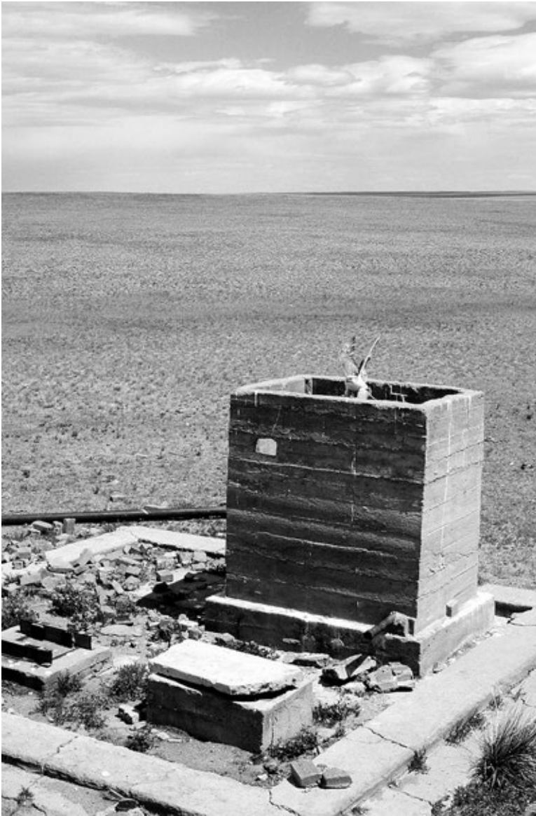
Figure 2. Adult Saker Falcon leaving the cistern eyrie, southeastern Mongolia, 8 June 1998. The hole was punched through the wall in June 1997 so the nestlings could fledge.

on foot without climbing) on easily accessible hillsides or even on the open steppe. In wolf ( Canis lupus ) and fox ( Vulpes spp.) habitat, such nests would seem likely to fail, but fledged young are regularly seen in and around these structures. Strangely, ground nests are occasionally seen immediately adjacent to conspicuous artificial objects. One surrounded a ca. 70-mm-diameter iron rod emerging from the steppe (Fig. 3). Another nest