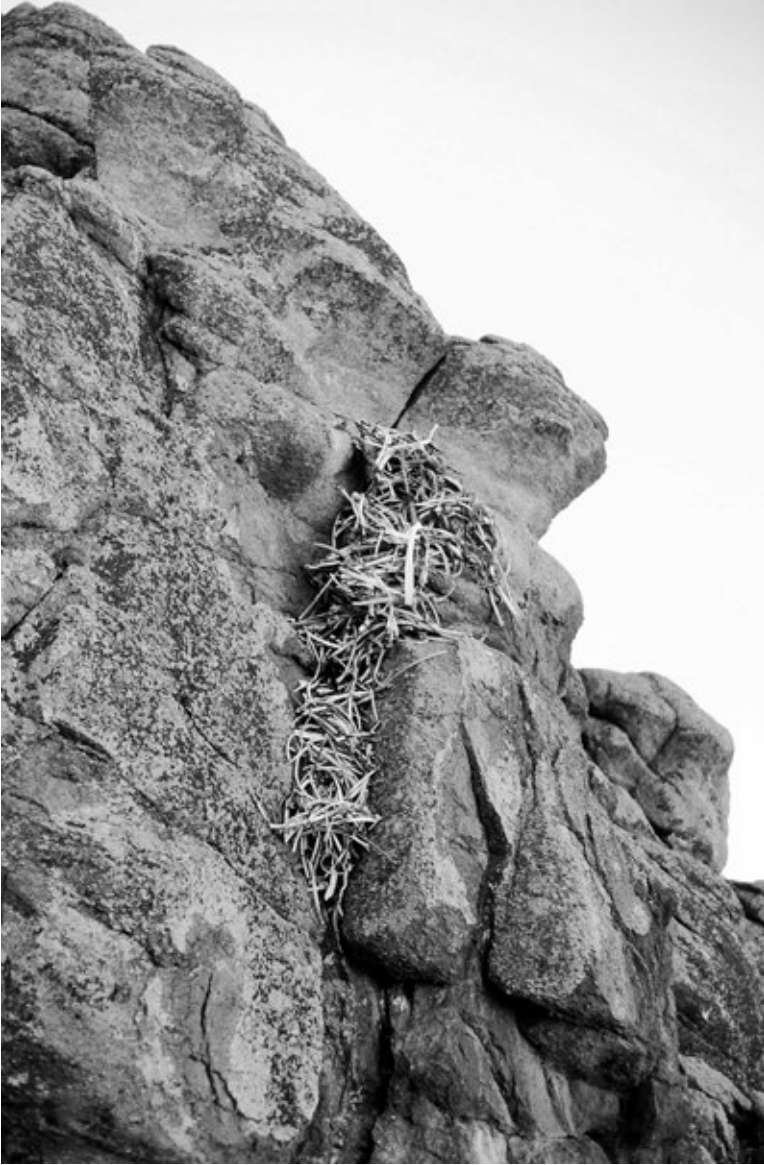
Figure 24. Common Raven nest (1998, central Mongolia) composed primarily of rib bones of large mammals. This nest was used in 2008 by Saker Falcons.

Geological Survey Southwest Biological Research Center, and Bureau of Land Management, Central Yukon Field Office.