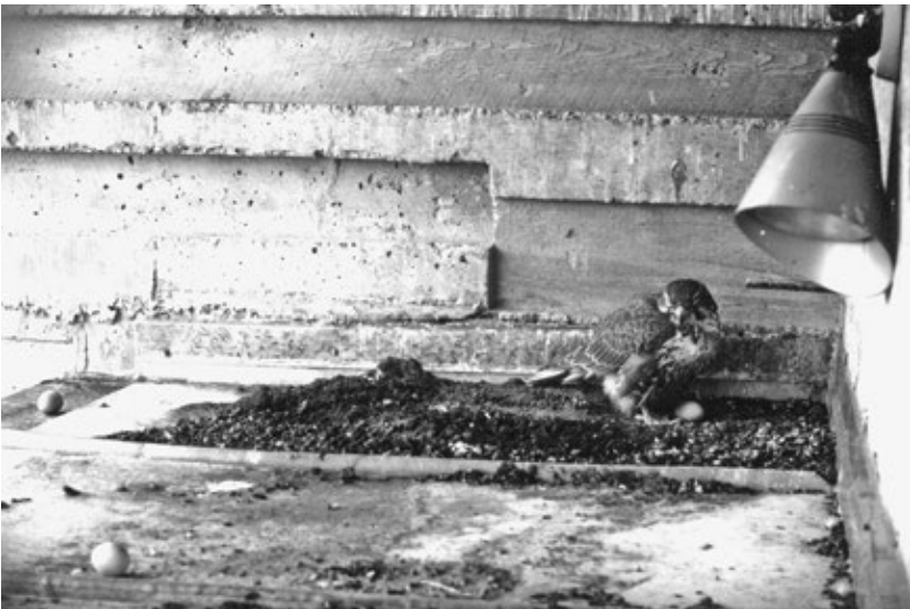
Figure 8. First documented nesting of Prairie Falcons on a building. Yearling Prairie Falcon at her scrape at the University of Calgary, 1 May 1974. Her third egg is in the scrape. The first and second are scattered about the metal ledge.

courting. The first egg was laid on 26 April in a thin layer of dried pigeon (Rock Pigeon [ Columba livia ]) manure on sheet metal in a back corner of a large, north-facing cavity (ca. 4 m × 1.3 m × 1.6 m high) just above the upper floor (Fig. 8). Rain turned to