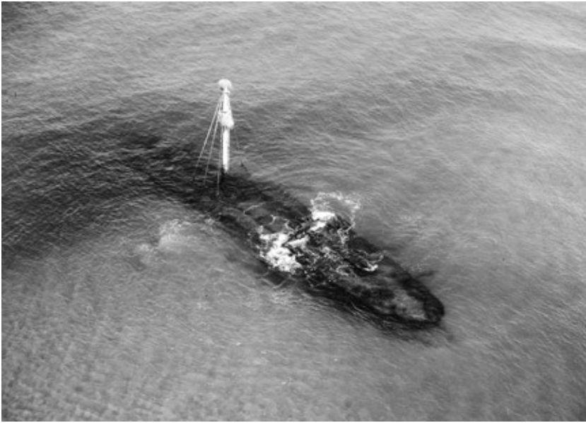
Figure 1. Osprey nest on the mast of a sunken boat, southern Baja California, 27 March 1977.

2000) are worth publishing. Our emphasis is on providing photographic documentation of some of the most unlikely records.