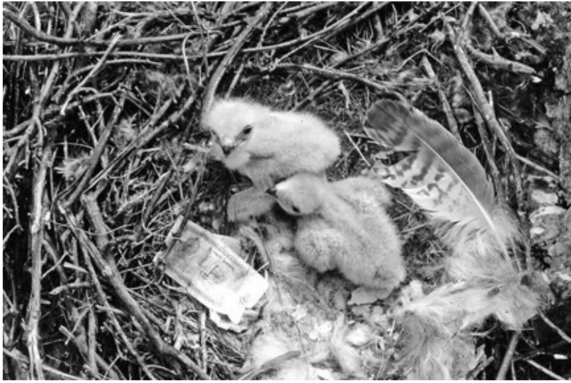
Figure 10. Paper money (two bills) line the cup of this Upland Buzzard nest, eastern Mongolia, 14 June 1995.

vegetation, we concluded that it arrived as nesting material, not as an attachment to mammalian prey.