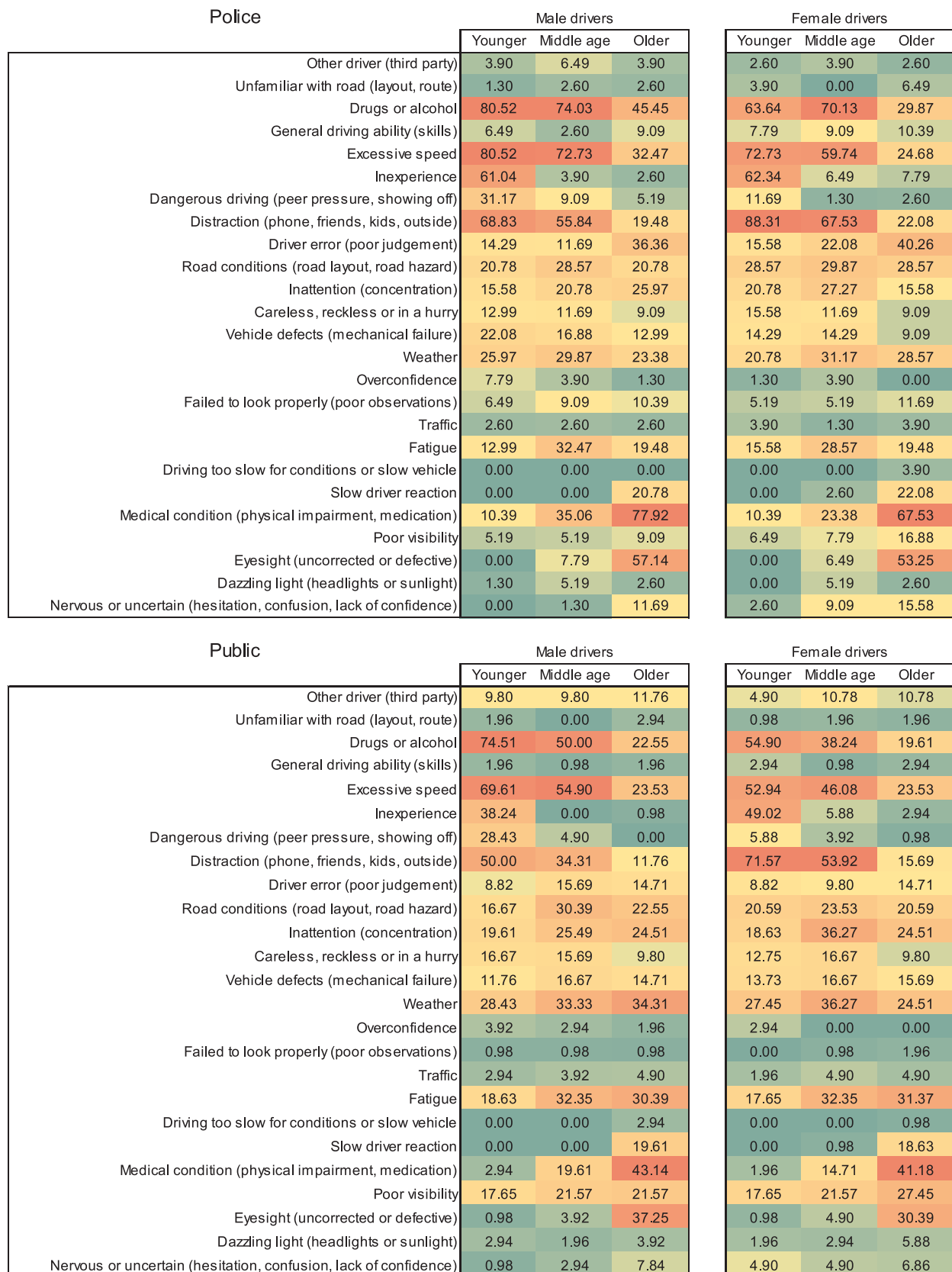
Fig. 1. The percentage of police officers and the public who generated each factor per age and gender of the driver in the hypothetical road accident scenarios. The color coding identifies the most frequent (red) to the least frequent (green) factors separately for each driver age and gender. (For interpretation of the references to colour in this figure legend and text, the reader is referred to the web version of this article).