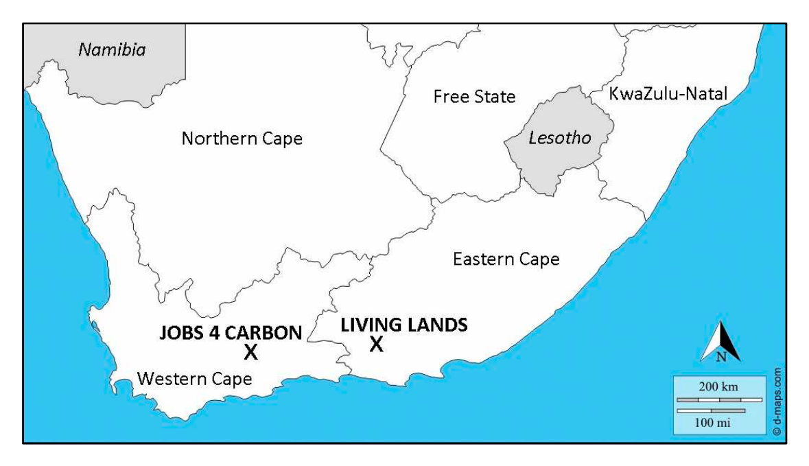
Figure 1. Ecological restoration case study projects, South Africa.

least three years (allowing for initial project impacts to be assessed) (While this last criterion allows comparability across cases, it must be noted that Living Lands has been operational for ten years, while J4C for 3 years. Despite the limitations in comparing achievements between projects of different duration—with J4C still being in an early stage of its learn-by-doing curve—this comparison provides useful insights in the assessment of implementation opportunities and challenges.).