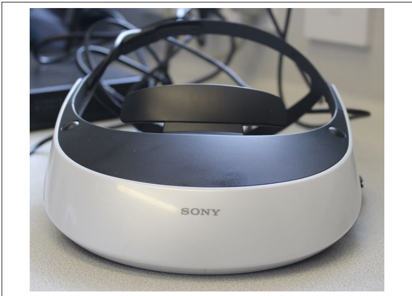
Figure 4. The VR headset used in Study 2.