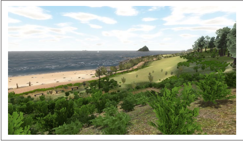
Figure 1. The virtual coastal environment.

previous cold pressor studies, which tend to include between 20 and 25 participants per experimental condition (e.g., Dahlquist et al., 2010; Sil et al., 2014). One participant was subsequently excluded from the analyses reported due to a research protocol violation (i.e., cold water temperature of 7.5 °C); including this participant does not change the pattern of results.