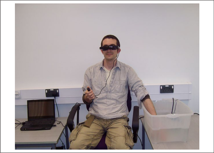
Figure 2. The setup of the study.

This moderate temperature was chosen, so that we could ensure a reasonable time of VR exposure during the pain experience. Participants used their dominant hand to hold the controller (in the active VR group) and their nondominant hand for the cold pressor task.