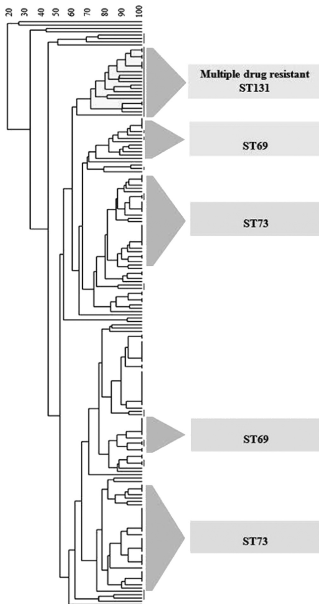
FIG 1 UPGMA cluster analysis based on the biochemical profiles of major sequence types.

b No. (%) of positive isolates is as follows: for ADO, 6 (2); for AGAL, 208 (69); for BGUR, 275 (92); for ILATa, 3 (1); for ILATk, 120 (40); for 5KG, 123 (41); for ODC, 227 (76); for O129R, 175 (58); for PHOS, 36 (12); for ProA, 28 (9); for SAC, 167 (56).