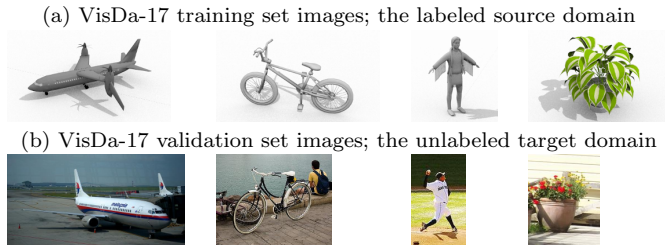
Figure 1: Images from the VisDA-17 domain adaptation challenge

Recent work [29] has demonstrated the effectiveness of self-ensembling with random image augmentations to achieve state of the art performance in semi-supervised learning benchmarks.