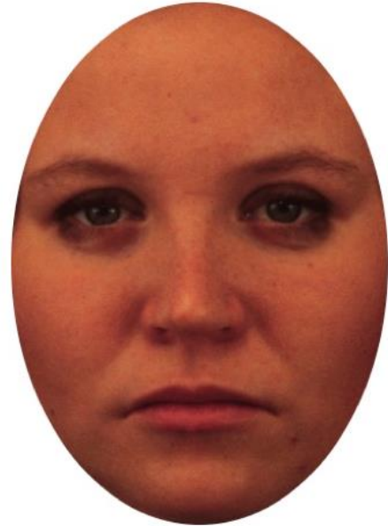
Figure 1. (A) Example of neutral face. (B) Example of corresponding tired face based on standardised manipulations of the neutral face, created using Plastic Surgery Simulator software. Specifically, manipulations of: increased pretarsal skin show; upper eyelid depression; dark circles under eyes; and drooped corners of the mouth were used (see Akram et al., 2017b for more detail).