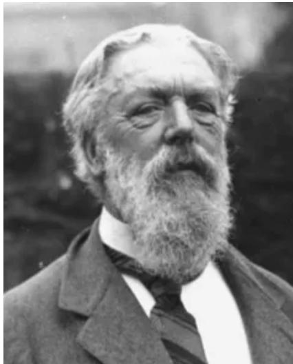
D'Arcy Thompson, a professor of natural history for 63 years at Dundee and St Andrews.

This year celebrates the 100th anniversary of the publication of On Growth and Form by renowned Scots zoologist D'Arcy Thompson , a professor of natural history at Dundee and St Andrews Universities for 63 years. So it was fitting in 2017 to animate a fossil from his large collection of zoological specimens at his museum in Dundee.