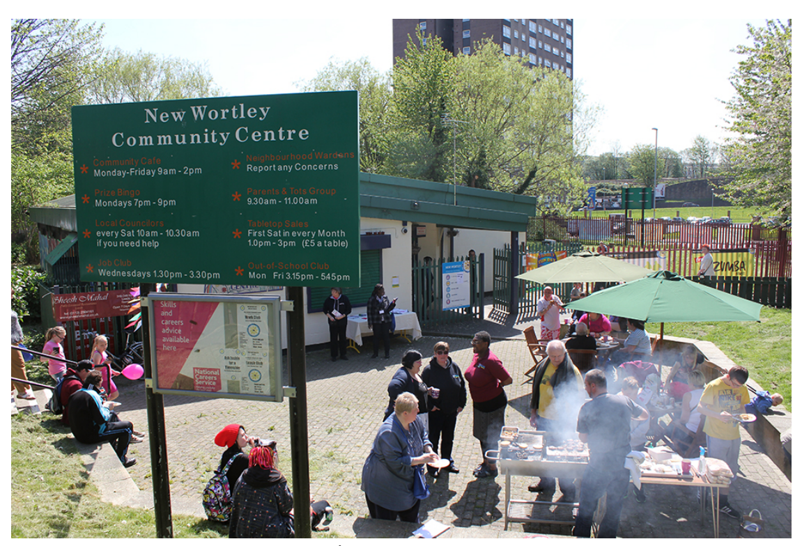
Figure 2. Summer BBQ at New Wortley Community Centre

The report's approach is based upon the idea that people are 'experts in their own situation', stating 'their knowledge and experience should be respected, and that they should be fully involved in decisions or developments that affect them. Primarily we consulted people 'on their own territory', i.e. by going to places we know they will be (on the street, cafes, community centres, events, etc.)' (Newton, 2015). LBU students helped with public consultation events held at the existing community centre.