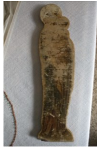
Fig. 2c “I entered the competition, and I won! I was so pleased” [P5]