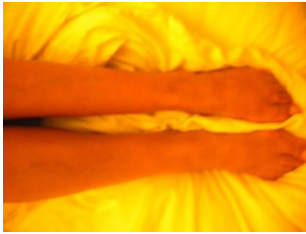
Fig. 4. “My leg is part of me and my being, and probably defines me really, really strongly” [P2]

Less surprising is finding limited cues for negative self-defining memories of challenging or ended relationships. This may be not because such cues are not necessarily there [37,38], but because people are not much motivated to cue the recall of painful memories. The limited reference to cues for negative self-defining memories focused on relational self may also be the reason for finding fewer cues for relational as opposed to personal self. Together, these findings suggest that people have a strong bias towards identifying possible cues for positive rather than negative self-defining memories.