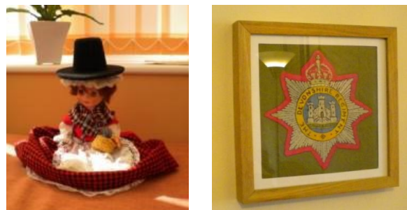
Fig. 1. Crafted objects as cues for self-defining memory: handmade doll cloth (P1) (left) and embroidery of a regimental badge (P7) (right).

Each submission will be assigned a DOI string to be included here.