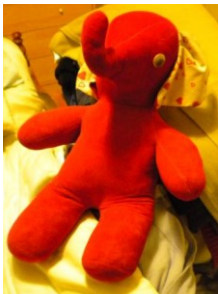
Fig. 2a. “The elephant represents memories of when the children were born” [P8]

Other participant mentioned an early self-defining memory as a precocious child and her trait as a fast learner: “I was three years old when I could read and write in two languages, and I knew my Math.” [P1]. Although not celebrated with a specific award, the achievement and the drive behind it have shaped her identity as determined and ambitious: “If I didn’t enjoy something, I wouldn’t waste my time doing it, but if I did, I would practice until I could be the best that I could” [P1].