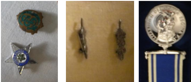
Fig.3. Awards for professional recognition: emblems (left), oak leaves cufflinks (center), medal (right) (P4)

Five participants mentioned achievement-related objects usually in paper or object format, including for example old school notebooks with high marks (P1,P2), certificates of academic or professional exams subsequently framed (P2), prizes from school competitions (P5) (Fig. 2c), and objects of professional recognition (P4) (Fig. 3).