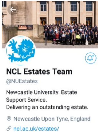
Figure 3: Existing engagement of the estates management team with students and staff on-campus via Twitter

Preliminary staff interviews were undertaken with: