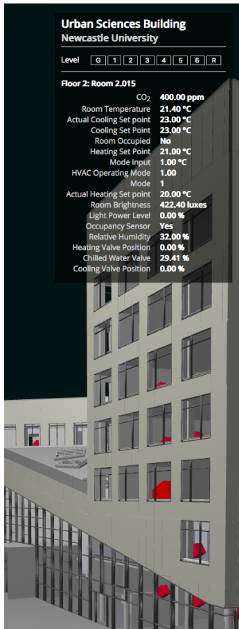
Figure 2: A screenshot from a spatial visualisation created using data [15] from the Urban Observatory, Newcastle University. For more information, please see: http://urbanobservatory.ac.uk/

site for this is often domestic, with participants being encouraged to take energy-saving actions through e.g. eco-feedback displays [12] or nudging awareness-raising of environmental impact [16]. Interventions in this domain are criticised for not accounting for novelty effects [4], and for framing sustainability as an issue of personal choice for rational actors [23]. This approach is problematic as such studies assume that human actors are able to make (and sustain) rational decisions about minimising energy use.