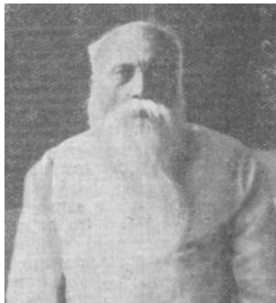
Brajendra Nath Seal (1864-1938)

This subjective, critical self-assessment forced upon a colonized philosopher the difficulties of finding an apt self-description for one’s own work. Did one engage in “Indian” or “Western philosophy?” One’s own positioning in these very colonial educational institutions came in the way of actively seeking to integrate indigenous ways of practicing philosophy into academic philosophy. The latter self-description was found inappropriate too. As Daya Krishna (1924-2007), an important figure in the development of philosophy in post-independence India, said: The “deepest anguish of an Indian intellectual” was that one was not treated as an intellectual equal in Europe (11). Struggling to find an appropriate self-description of one’s work, these intellectuals were also plagued by methodological concerns. Should one disinterestedly, and