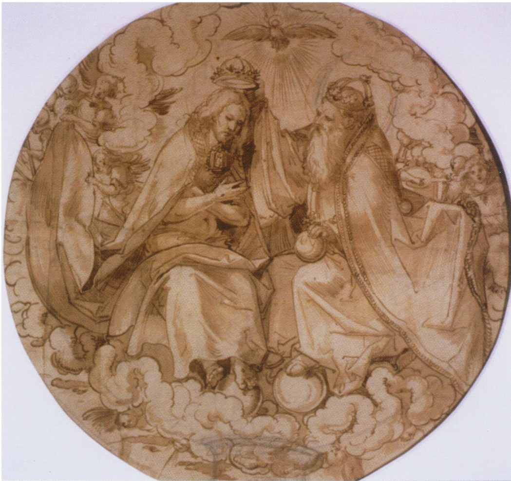
No. 1. Michael Attas et al., spectroscopic image analysis of Veit Hirschvogel, the Elder, Untitled (The Holy Trinity) , ink, wash, charcoal, red pigment on paper, 39.9 × 39.1 cm, 15th century. (a, top) Drawing as it appears to the eye. (b, bottom) Drawing enhanced using spectroscopic imaging and principal-components analysis to highlight differences among near-infrared spectra of materials. Charcoal lines are coded red. (Collection of the Winnipeg Art Gallery; Acquired with the S.C. Eckhardt-Gramatté Memorial Fund, [Accession # G-75-3]. © E. Michael Attas. Photo © Cathy Collins, The Winnipeg Art Gallery).