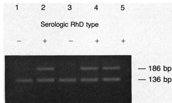
Figure 2. Reaction Products after the Amplification of Regions of Both the RhCcEe and RhD Genes (136 bp) and a Region Specific to the RhD Gene (186 bp) from DNA Prepared from Amniotic-Fluid Cells from Five Fetuses.

Either chorionic-villus sampling or amniocentesis could be used for the prenatal determination of the RhD genotype. Amniocentesis might be preferred for several reasons. Chorionic-villus sampling is associated with higher risks of fetal loss and late-pregnancy