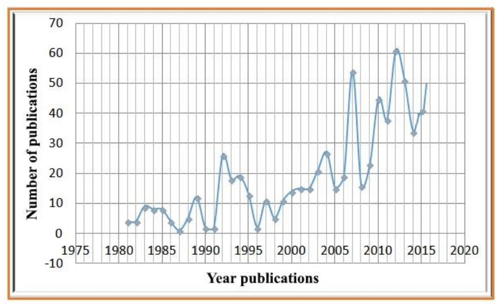
Figure. Chronology of the publication on the subject T \beta 4

Some researches of properties of peptide of Tβ4