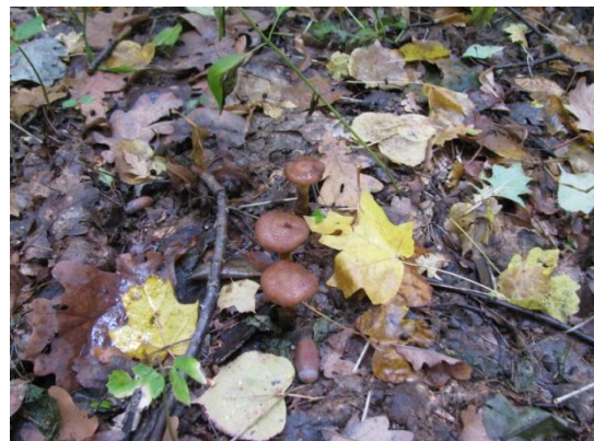
Fig. 1: Fruit bodies of honey fungi A. mellea s. l. of ecomorphotype #1. a) at the foot of a living oak b) in soil with underground trees remains