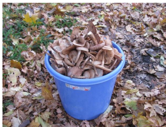
Fig. 2: Fruit bodies of honey fungi A. mellea s. l. of ecomorphotype #2. a) at the foot of a dead aspen b) gathered in a bucket

The next identification stage is detection of belonging of each of two local ecomorphotypes to a certain species: A. cepistipes or A. Gallica according to colour and form of cap, stipe, size and concentration of squames on fruit bodies' caps [4].