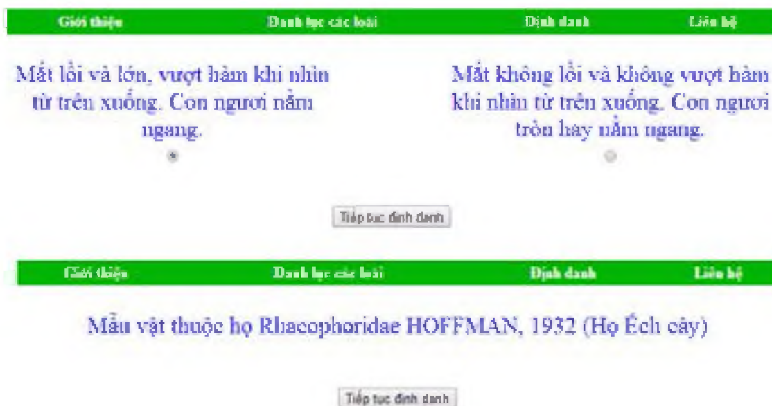
Figure 4: Steps in identification

identification features are shown, one of them must be chosen for further identification. Pages with options would be repeated until a species is identified (Figure 4).