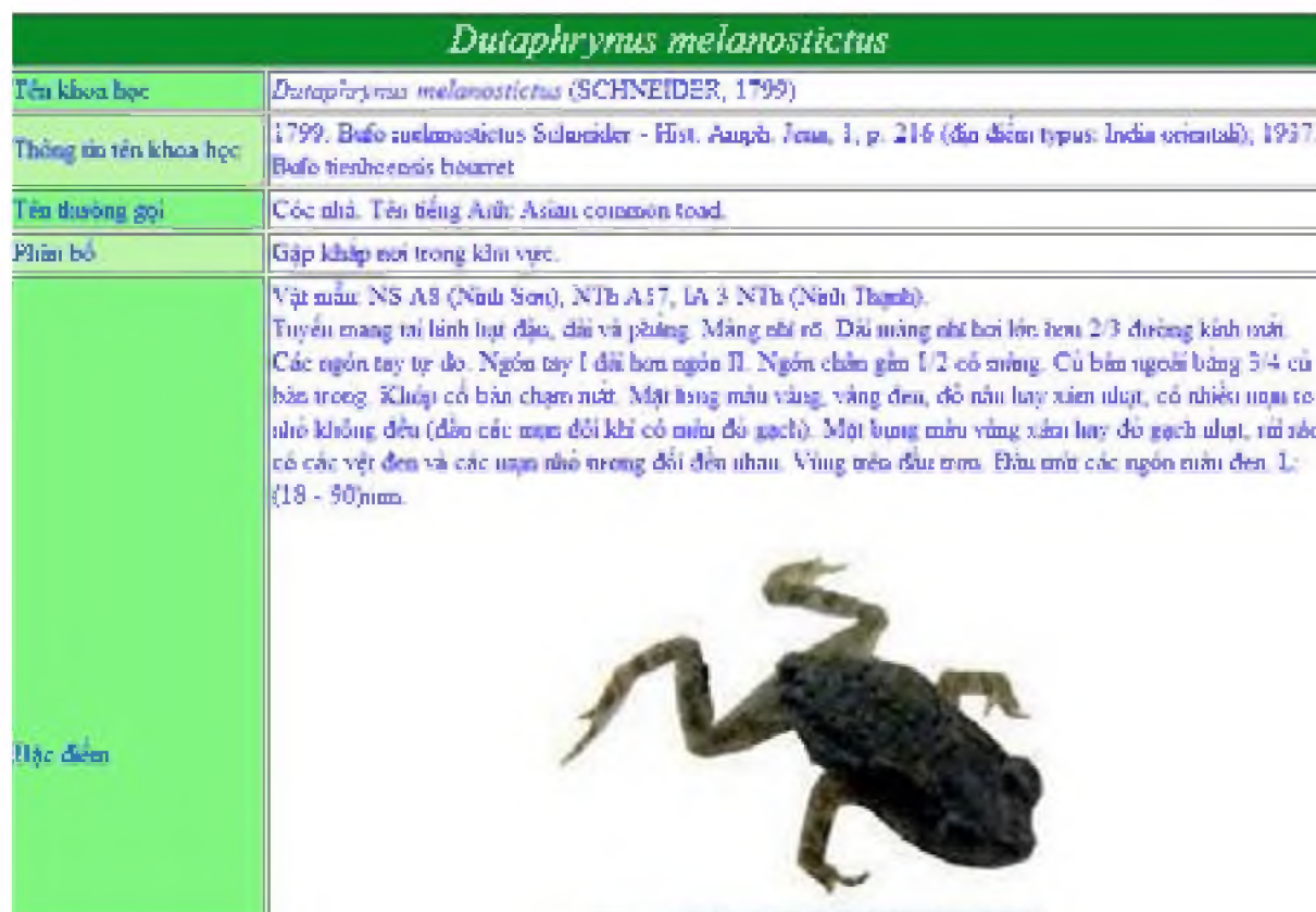
Figure 3: Detail information of an amphibia

Detail information of species consists of scientific name, Vietnamese name, biological features, location of distribution... as shown in Figure 3.