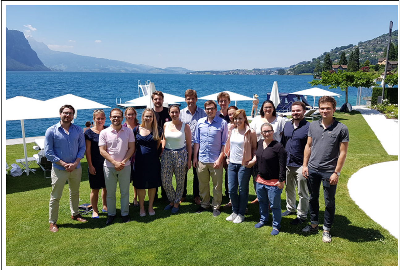
Figure 2. The SAYN Core Group at its last workshop in Vitznau, June 2017. SAYN: Swiss Association of Young Neurologist.

Despite increasing efforts, contact with private neurological practice usually remains somewhat underrepresented during neurological training. The SAYN intends to develop concepts for further improving interaction between neurologists in training and those in private practice, to provide significant two-way flow of information, to better guide development of interested juniors towards private practice and thus to help ensure continuity of neurological care. Recently, the SAYN has been mandated by the SNS to contribute to evaluation and development of a rotation concept for neurology residents into private practice.