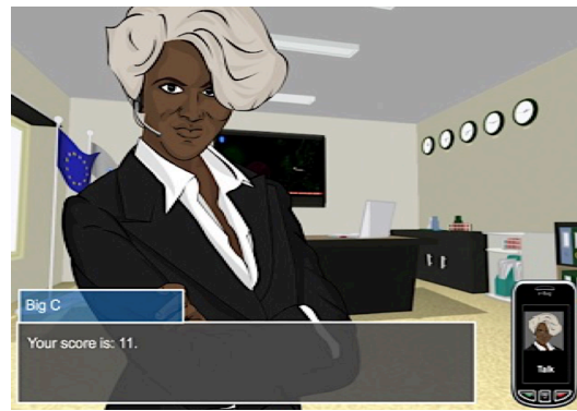
Fig. 3. Score Computed based on the Weight attached to Player's Answers in the Game

Seamless Evaluation [17] has been defined as an evaluation embedded through the educational content in such a way that is not intrusive to the user. The extension presented here would allow the authors to create a summative assessment, by