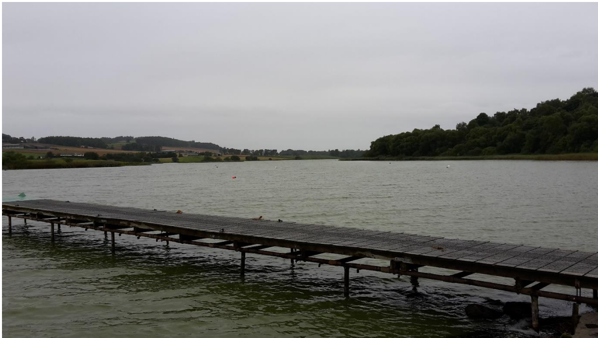
Figure 2. Rescobie Loch (looking west from eastern end, by outflow)

Balgavies Loch and has a surface area approximately three times greater, i.e. 59 ha compared to 17.4 ha (UK Lakes Portal).