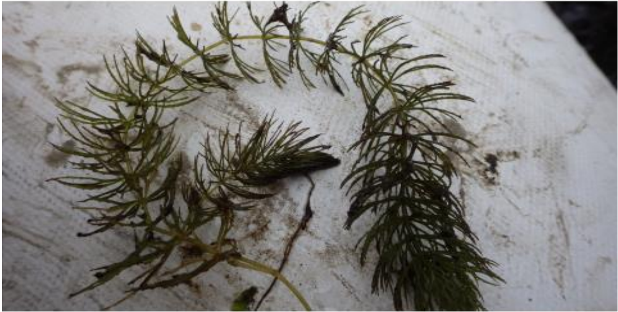
Figure 12. Ceratophyllum demersum collected from Pond 2