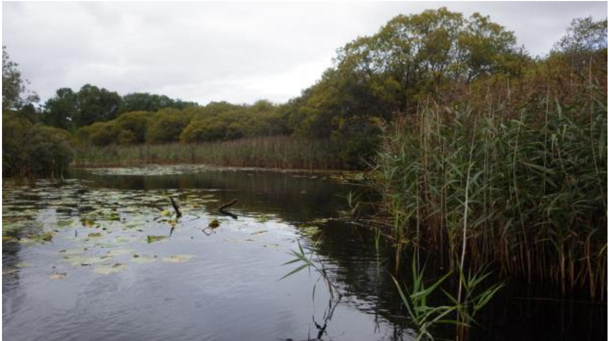
Figure 10. Northern margin of Pond 2 with Phragmites australis stand