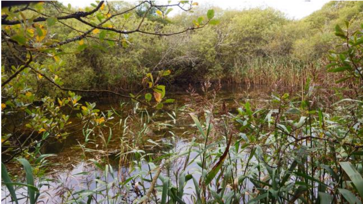
Figure 22. Inlet Pond from eastern shore