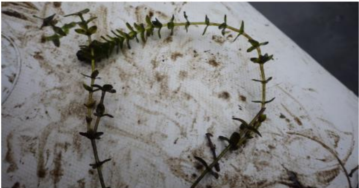
Figure 13. Elodea canadensis collected from Pond 2