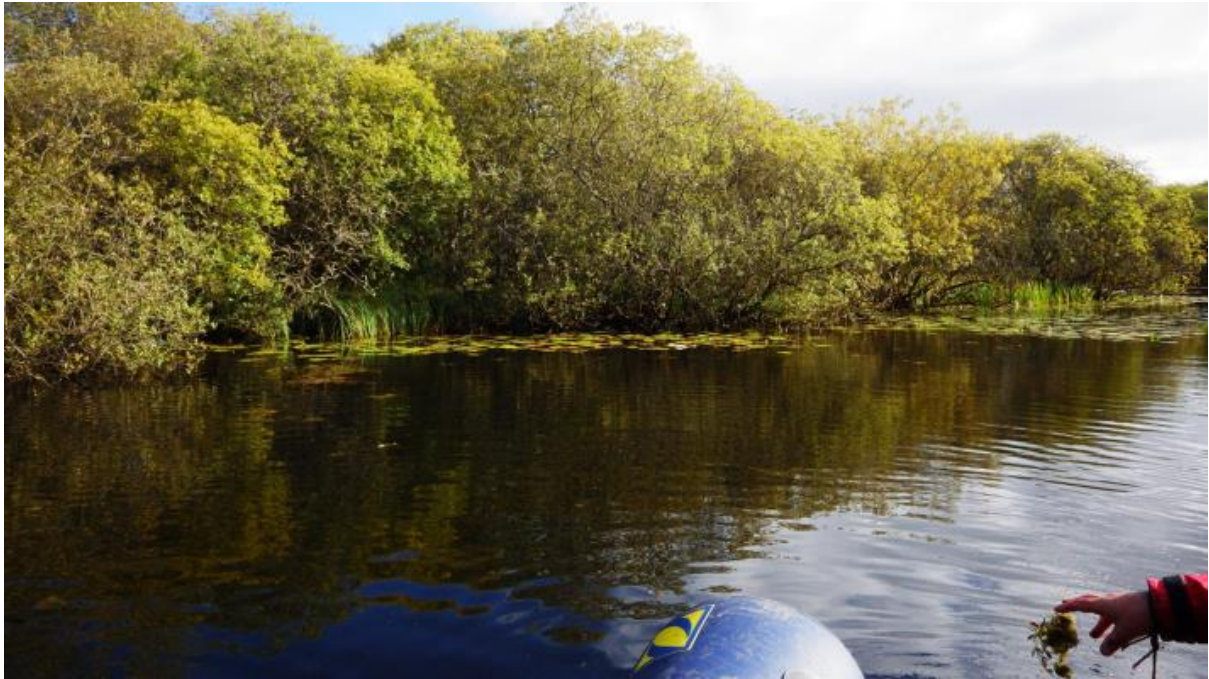
Figure 20. Northern margin of Pond 1