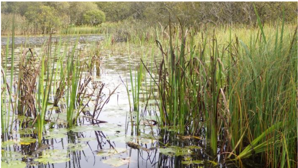
Figure 11. Southern margin of Pond 2 with Sparganium erectum stand