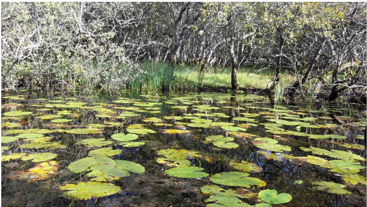
Figure 15. Nuphar lutea stand in Pond 1