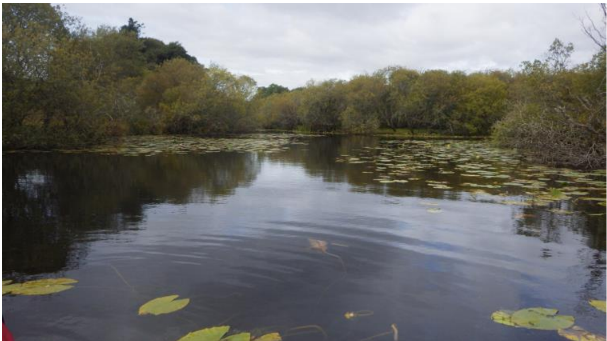
Figure 21. Looking west along Pond 1 from eastern shore