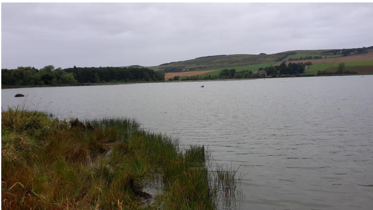
Figure 3. Rescobie Loch (looking north-west from southern margin)

Rescobie Loch is currently classified as a natural eutrophic standing water. However, historically it may have been more mesotrophic as it formerly contained a rich community of aquatic macrophytes, with a diverse assemblage of 14 Potamogeton (Pondweed) species and hybrids recorded before 1947 (Steven, 1988; Table 1). In