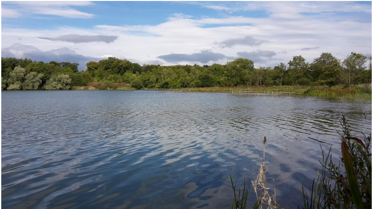
Figure 5. Balgavies Loch (eastern end)

Balgavies Loch (Figures 5 and 6) is c. 0.5 km downstream of Rescobie Loch, connected by the Lunan Water. Balgavies Loch occurs at an altitude of 61 m, has a perimeter of 2 km, with a mean depth of 3.0 m and a maximum depth of c.9.4 m in the east basin (Murphy and Kendall, 1988; Murray and Pullar, 1910; UK Lakes Portal).