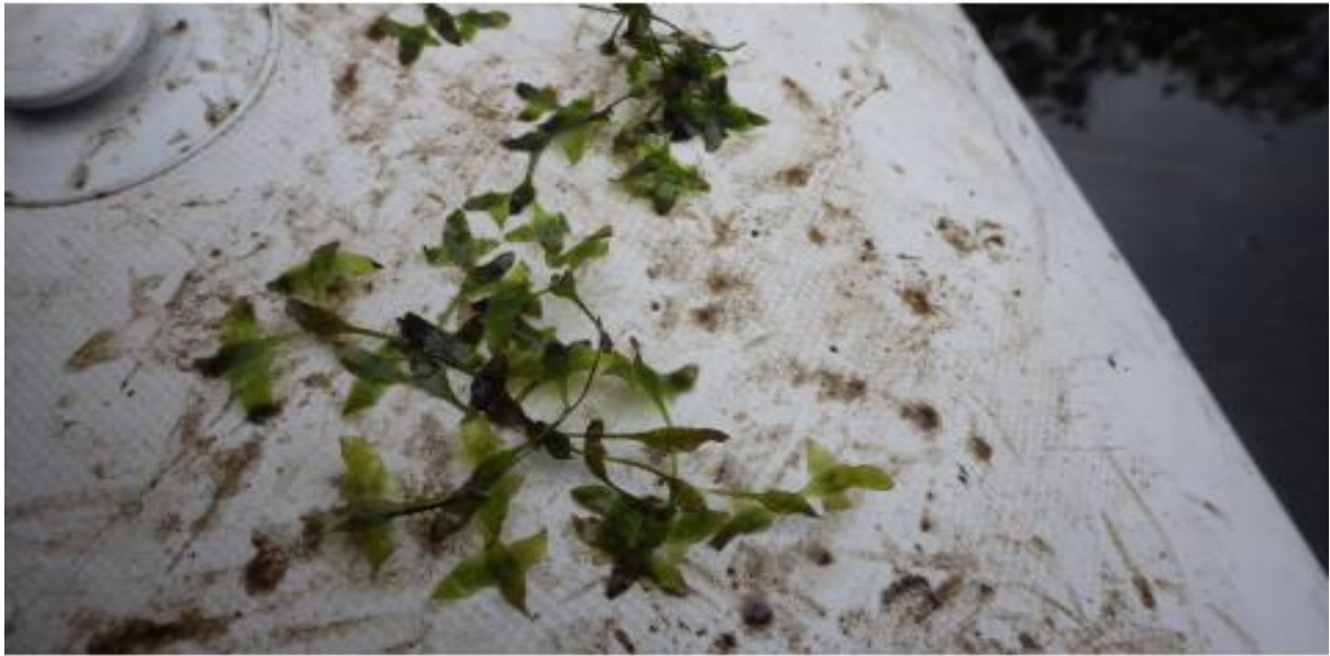
Figure 14. Lemna trisulca collected from Pond 2