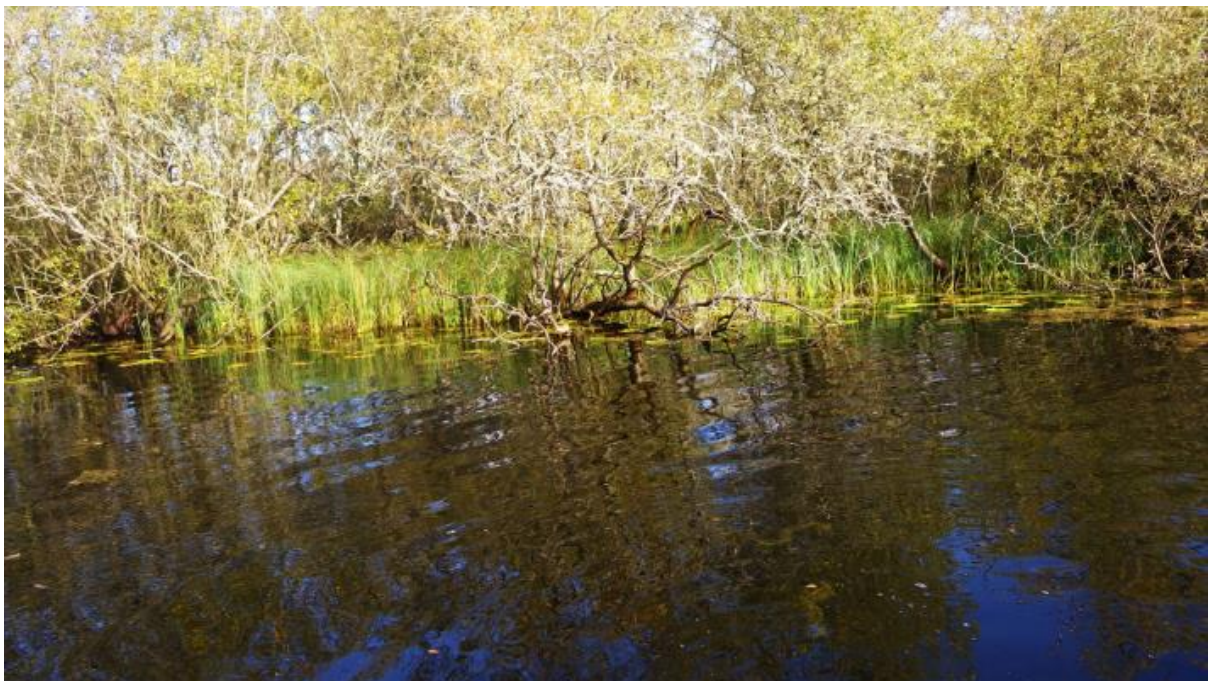
Figure 19. North-eastern margin of Pond 1