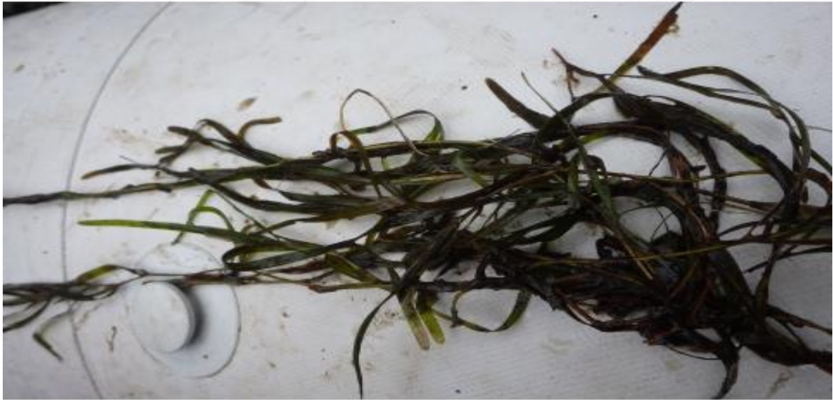
Figure 16. Potamogeton obtusifolius collected from Pond 2