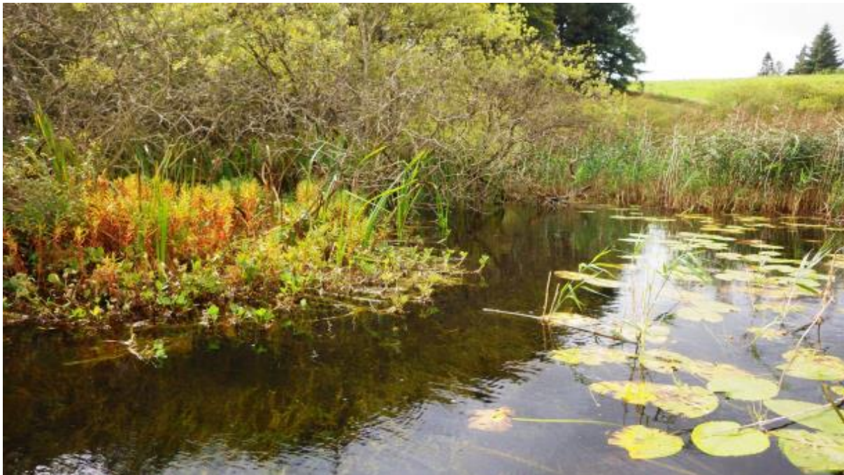
Figure 9. South-western margin of Pond 2, Lysimachia thyrisiflora in foreground

19-21) had a smaller surface area but a greater water depth than Pond 2 but lacked the two Potamogeton species and Elodea canadensis was rare. However, in the Inlet pond (Figure 22) and the sampled section of the Inlet from the Lunan Water, Elodea was the dominant submerged plant species. Unlike Rescobie and Balgavies Lochs, there was no evidence of cyanobacterial blooms in any of the sampled water bodies in the Chapel Mires site and water clarity was excellent with Secchi Disc readings of 2.20 recorded in Pond 1. Evidence of this better water quality was reflected in the lower PLEX scores calculated for Pond 2 and the other sampled waterbodies in the Chapel Mire site, compared with the PLEX scores recorded in the recent surveys of Rescobie and Balgavies Lochs (see Tables 1-3). Ponds 1, 2 and the Inlet Pond all key out, based on their aquatic macrophyte communities, as examples of Group G standing waters, i.e. central and eastern, above neutral, lowland lake, with Lemna minor , Elodea canadensis , Potamogeton natans and Persicaria amphibia (Duigan et al. , 2006).