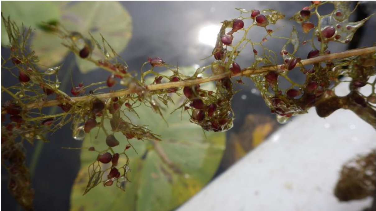
Figure 18. Utricularia vulgaris agg. collected from Pond 1