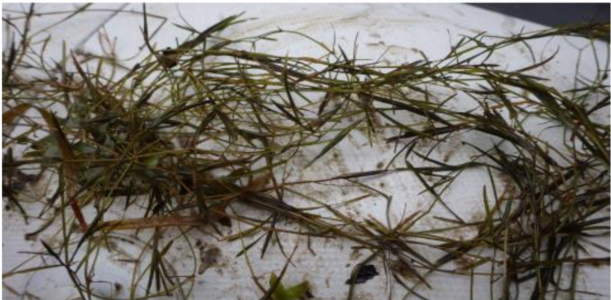
Figure 17. Potamogeton pusillus collected from Pond 2