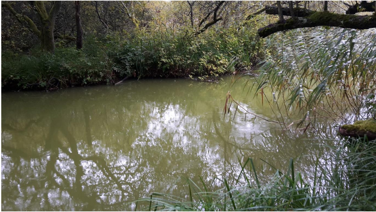
Figure 4: Lunan Water: outflow from Rescobie Loch