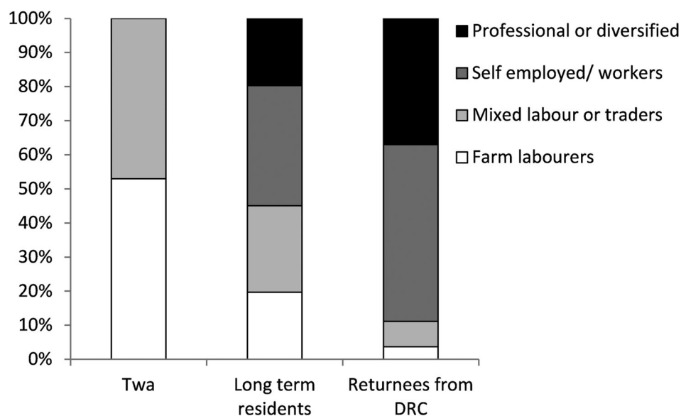
Figure 2. Occupations across the three broad socio-cultural groups.