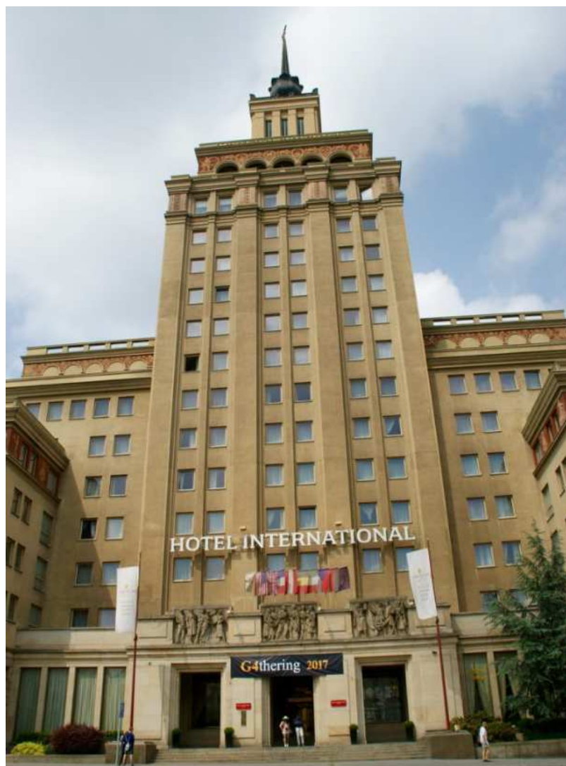
Figure 1: The 6th G4thering was held at the Hotel International, Prague.

G-quadruplexes are four-stranded nucleic acid secondary structures formed from guanine-rich sequences (Figure 2) [6-8]. The underlying motif is the G-tetrad, a planar arrangement of four guanine residues stabilized by Hoogsteen hydrogen bonding and coordination to a central cation. Multiple tetrads stack to form the quadruplex, and many different topologies can arise depending on how the primary DNA structure folds into these arrangements. The study of G-quadruplexes is highly interdisciplinary. To start with, it requires a complex suite of spectroscopic methods to elicit their detailed structures. This is complemented by state-of-the-art biochemical approaches, including the development of highly specific probes and reporters, to build evidence that these structures do indeed occur in living systems and understand what role they undertake in health and disease. Fortunately, quadruplex scientists are an ingenious bunch and the literature is rich with work that has truly transformed the field from mere intellectual curiosity to a hot topic that is taking great strides into molecular biology, pharmacology, and even the design of functional nanoscale architectures and molecular machines.