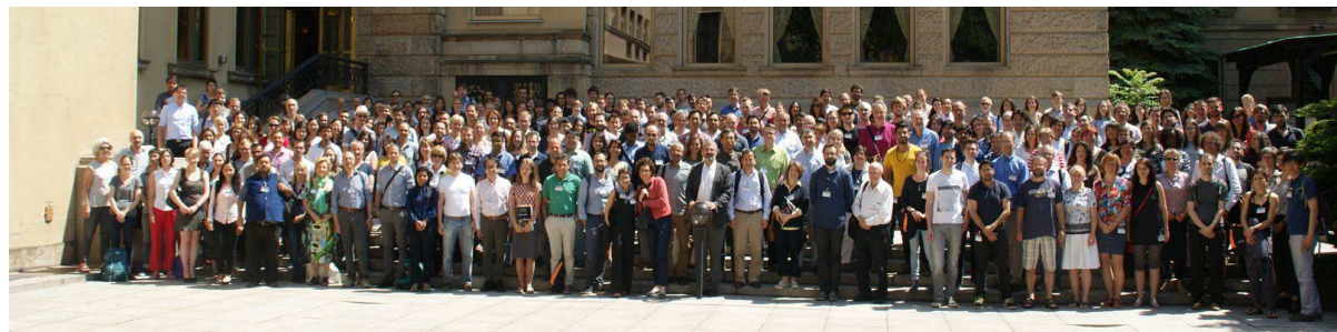
Figure 4: Quadruplex self-assembly! Conference delegates get together for a group photo.