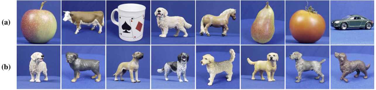
Figure 4. (a) examples from the eight object categories in the ETH-80 dataset; (b) examples of various classes within an object category.

of Affine Hull Image-Set Distance (Kernel AHISD) [9]. For GDA and KGDA the projection kernel ( k^{[\text{proj}]} ) was used. For the first kernel in KGDA (the kernel applied in vector space) we considered Gaussian, polynomial and linear kernels; the best obtained results are reported.