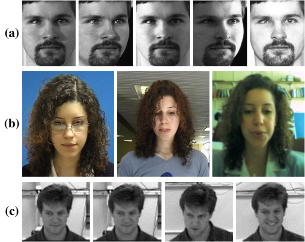
Figure 3. Examples of appearance variations in (a) CMU-PIE, (b) BANCA, (c) CMU-MoBo. The variations include pose, illumination, expression and image quality.

image sets as test data. Images were cropped to the internal part of the face (ie., closely cropped, no background) and downsampled to 32 \times 32 pixels.