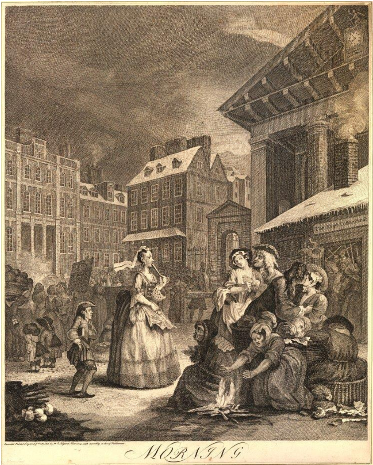
Figure 6. William Hogarth, 1736, 'Morning', Four Times of Day , plate 1.