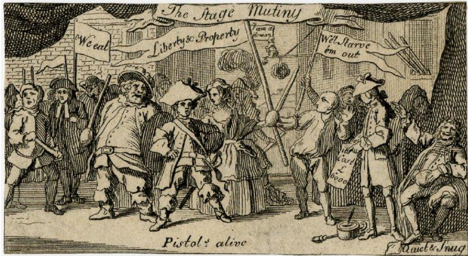
Figure 5. Anon. after John Laguerre, c.1733, The Stage Mutiny .