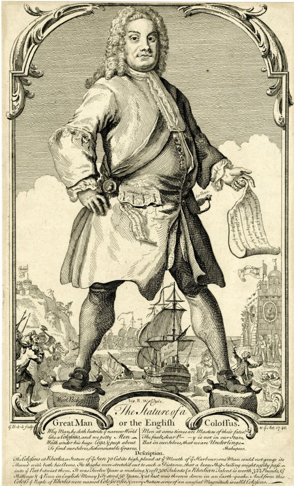
Figure 4. George Bickham the Younger, 1740, The Stature of a Great Man, or the English Colossus . Courtesy of The British Museum Collection Online. Accessed 22 January 2017. Available at: http://www.britishmuseum.org/research/collection_online . Permission to reproduce this image has been granted by The British Museum.