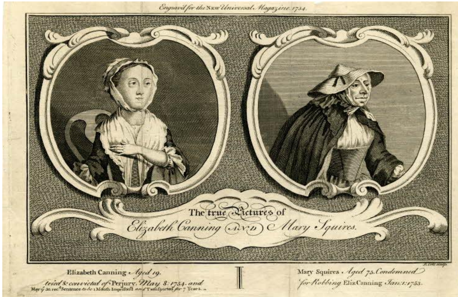
Figure 1. Anon. c. 1753-1760. The true Pictures of Elizabeth Canning and Mary Squires. British Museum Collection Online. Accessed 22 January 2017. Available at: http://www.britishmuseum.org/research/collection_online/search.aspx.