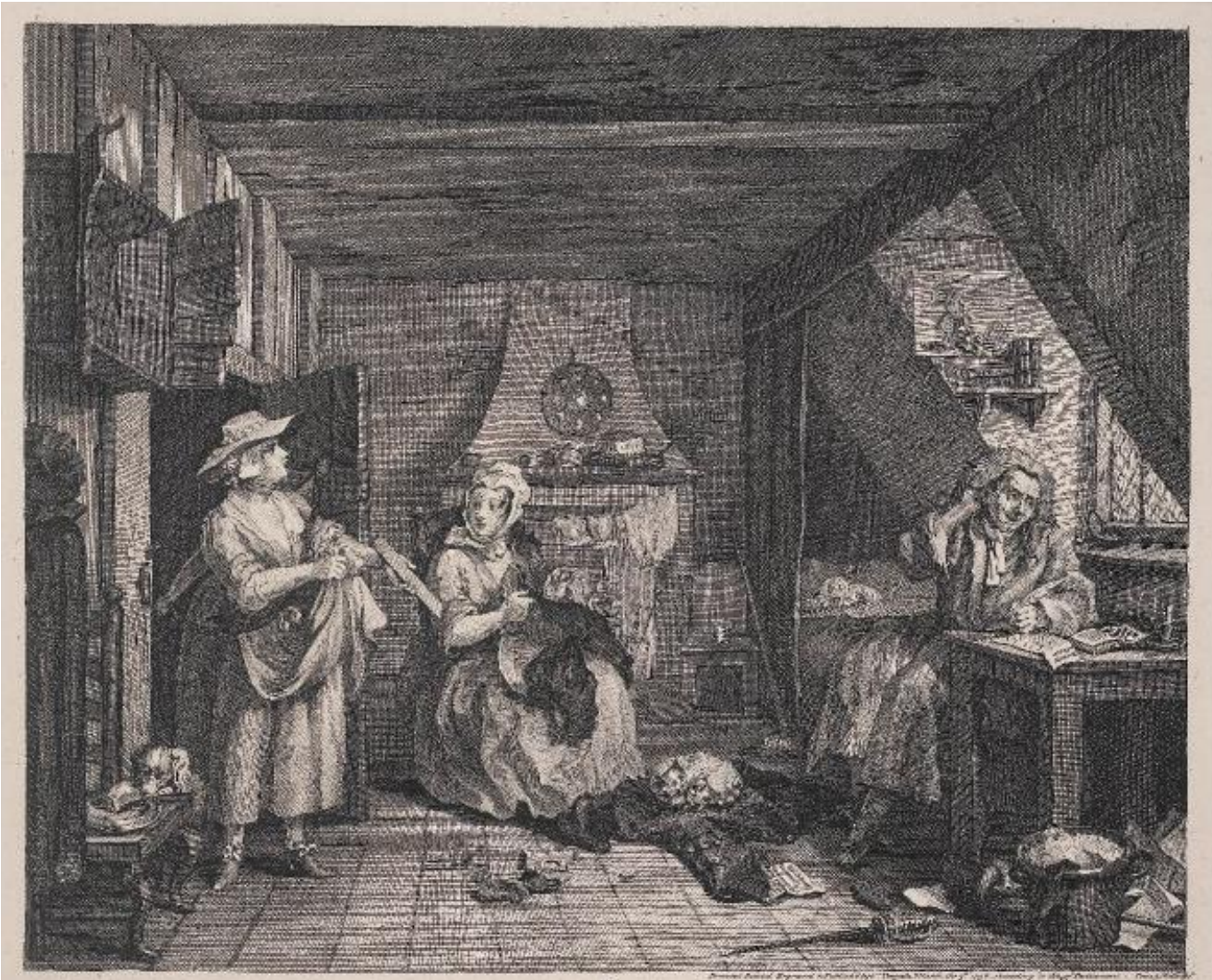
Figure 2. William Hogarth, 1737, The Distressed Poet . Courtesy of the British Museum Collection Online. Accessed 03 January 2018. Available at: http://www.britishmuseum.org/research/collection_online/collection_object_details.aspx?objectId=1361757&partId . Permission to reproduce this image has been granted by The British Museum.

Studious to sit, with all his books around, Staring from thought to thought, a vast profound | Plung'd for his sense, but found no bottom there ; Then writ, and stumber'd on, in mere despair.