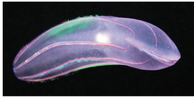
Figure 4. The bioluminescent comb jelly, Beroe cucumis , occurs at depths that can be penetrated by artificial light.

Several studies have shown that the attraction of nocturnal Lepidoptera to street lights at night results in aggregations upon which opportunistic bat species often prey