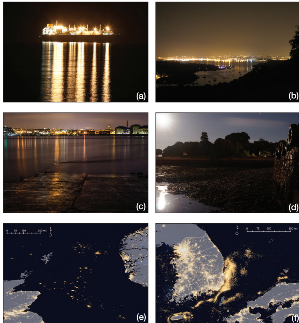
Figure 2. Sources of artificial light in marine ecosystems. (a) Artificial lights from ships that anchor in Falmouth Bay, UK. (b) The lights of Plymouth, UK, illuminating the Tamar Estuary and its creeks and tributaries. (c) Decorative, harbor, and municipal lighting spilling onto the Tamar, viewed from Cremyll, UK. (d) Moonlight cast onto the shores of Cremyll in the Tamar Estuary, UK. (e) Oil rig lighting across the North Sea captured by satellite. (f) Light fisheries target squid spawning grounds in the Tsushima Strait.

been demonstrated in various fish species (Marchesan et al. 2005). For instance, sea cages that are artificially lit affect depth selection in Atlantic salmon ( Salmo salar ; Oppedal et al. 2011), while coastal lighting around estuaries can aggregate fish in artificially lit habitats (Becker et al. 2012). Indeed, the attraction of the larval stages of many fish species to artificial lights has led to the development of light-based trapping methods that are analogous to those used for trapping nocturnal Lepidoptera (Doherty 1987). Artificial lights are commonly used by the fishing industry to attract and catch several squid species. Those lights are so powerful that nighttime satellite images can be used to quantify fishing pressure, spawning grounds, and migration routes (Figure 2f; Kiyofuji and Saitoh 2004). The geographically widespread use of powerful artificial lights in these fisheries is