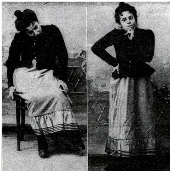
Figure 1 A classical picture of sensory trick ( geste antagoniste ) in spasmodic torticollis. 5 Left : without trick. Right : abnormal posture is corrected by placing the right hand on the hip bone and touching the chin with the left hand.

Detailed immunohistochemical studies have suggested that the striatal projection neurons (medium spiny neurons (MSNs)) affected in the early dystonic phase of the disease likely are located in striosomes, a neurochemically defined compartment in the striatum, as opposed to the striatal matrix, for which a marker (calbindin) remained (figure 2). No recognisable abnormalities were observed in the cerebellum in these cases.