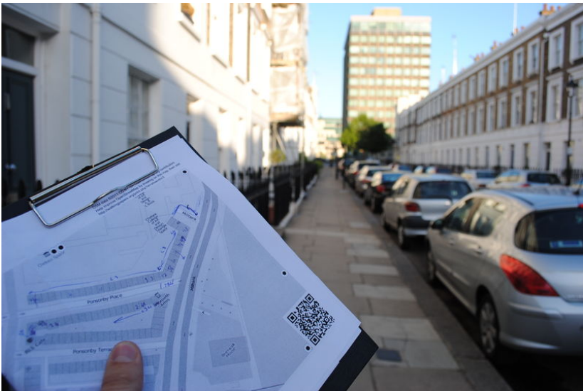
Figure 2 – Walking paper.

To understand the lack of mobilization of the volunteers, it is important to have a clearer idea of what kind of an activity mapping is. OSM is generally presented as a platform where everyone, once registered, should be able to contribute. To take part in drawing the map, one does not need expensive tools: the basic process is to print the area to be mapped on “walking papers” (figure 2) and start listing the items lacking in the public space, whether those items would be buildings and roads, or traffic lights, trees and pedestrian crossings. To help her in her task, one could use a GPS or smartphone, to record geographical position and take pictures of the area.