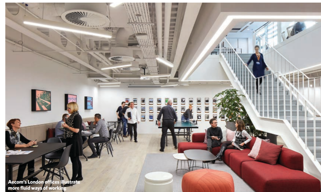
Aecom's London offices illustrate more fluid ways of working

It remains to be seen whether anyone will be bold enough to speculate on whether the lighting energy numerical indicator (Leni) will serve to buttress this photopic status quo, particularly if adopted in legislation.