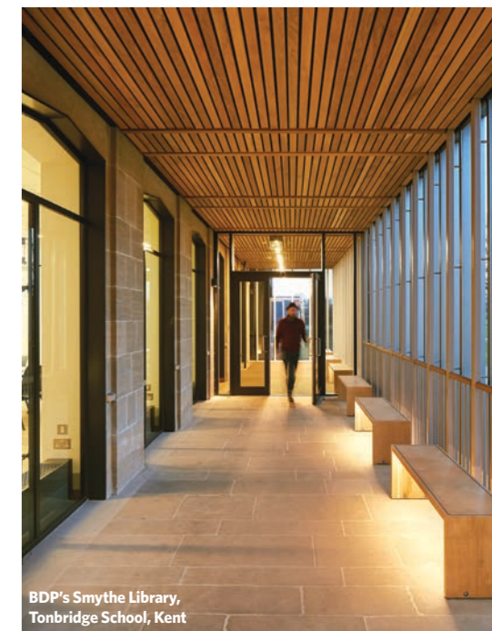
BDP's Smythe Library, Tonbridge School, Kent