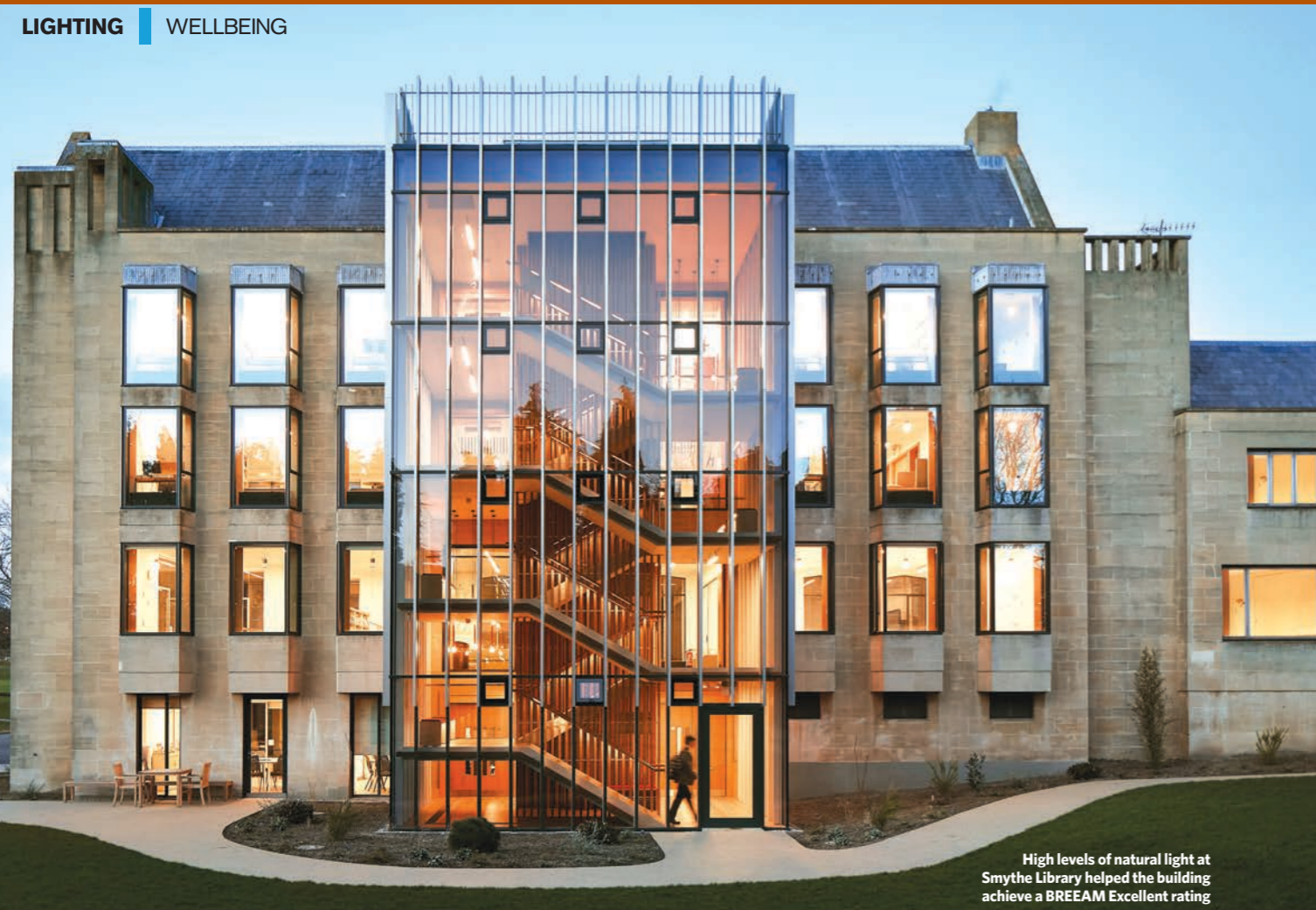
High levels of natural light at Smythe Library helped the building achieve a BREEAM Excellent rating