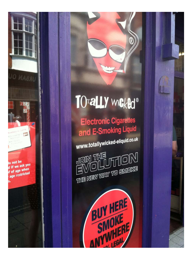
Figure 2 An example of an exterior e-cigarette advertisement.