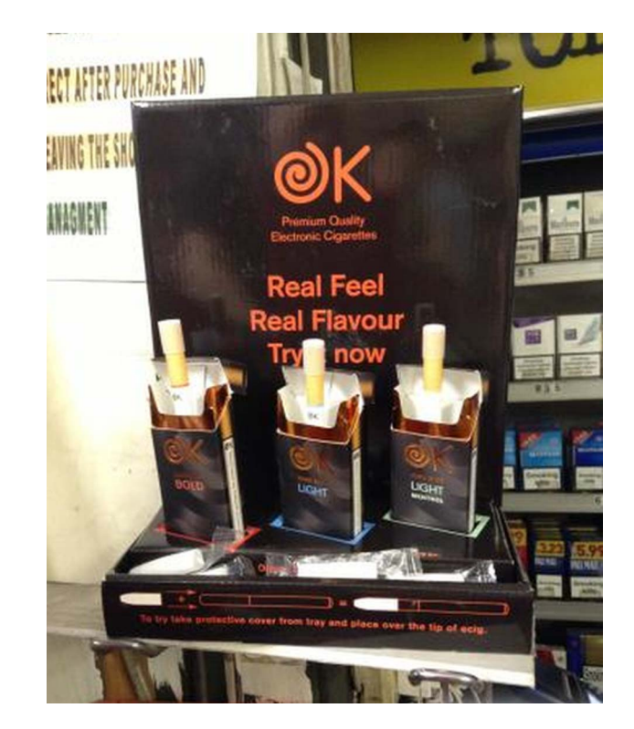
Figure 1 Point-of-sale movable display that invites store customers to sample the e-cigarette by providing disposable plastic covers to put over the tip.

interior or exterior advertisements, or featured a movable display. Point-of-sale movable displays are branded structures that combine advertising with product presentation. They are commonly found at the cash register and are made of plastic or cardboard. See figure 1 for an example of a point-of-sale movable display and figure 2 for an advertisement.