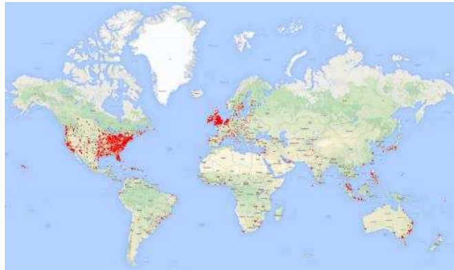
Figure 1. World map to show the geographic spread of tweets that contained geolocation information for the tweets collected in this dataset.

Twitter provides geolocation data with each tweet; this is known as ‘gold standard’ geolocation data, as location information from users Twitter biography may not be accurate. However, not all users enable this feature, thus not all tweets will contain geolocation data. In total 15,601(0.91%) out of 1,710,121 tweets contained valid latitude and longitude data. The majority of tweeters were based in the USA and the UK (see Figure 1).