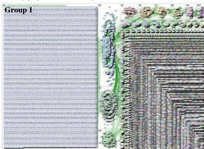
Figure 4. Network analysis for tweets sent and received on April 2nd, 2015 related to the keywords used to retrieve data

When examining exact duplicates it is possible to investigate the most frequently occurring tweets in this dataset. We found that that 8 out of the 10 most popular retweets were related to WAAD, therefore there was an observed increased interest in this during this time period. The manually-coded set of tweets was used to train a machine learning classifier using a Naïve Bayes algorithm. The entire dataset of tweets was then classified: 68,547 (81%) of tweets were classified as related to WAAD and 16,455 (19%) of tweets were not related to WAAD. In order to undertake additional analyses, a network graph was developed using NodeXL (Social Media Research Foundation, n.d.). The resulting graph is shown in Figure 4.