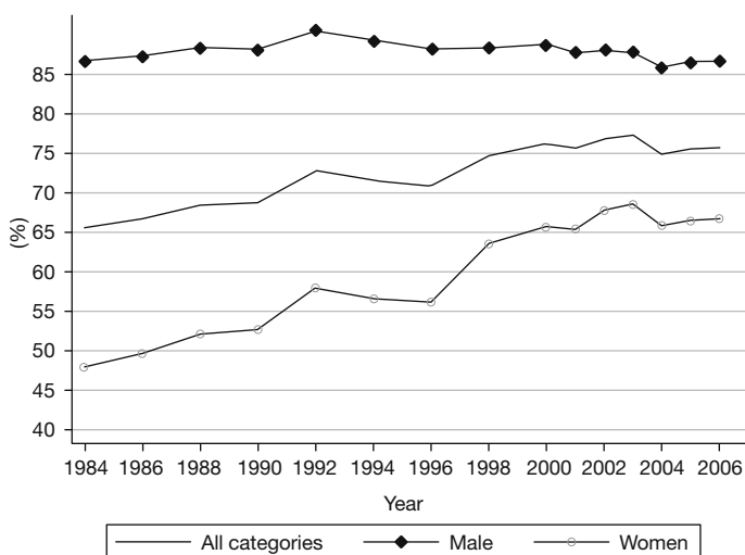
Figure 1. Participation rates (men vs. women).

Whereas male labor participation has been stable, above 85% over the same period, females have substantially increased their labor market participation from nearly 47% in 1984 to around 65% in 2006 (See Figure 1). Despite the increase in female participation rates, their current participation rate still remains significantly lower than that of males. The bulk of the increase in the female participation rate was observed during the 1980's and 90's, whereas in the 2000's participation remained fairly stable 7 .