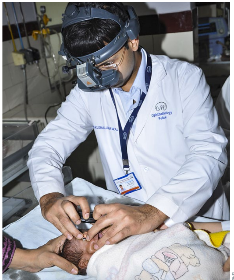
Figure 1 Ophthalmologist screening for ROP using indirect ophthalmoscopy

ophthalmologist must always be available to interpret the images.