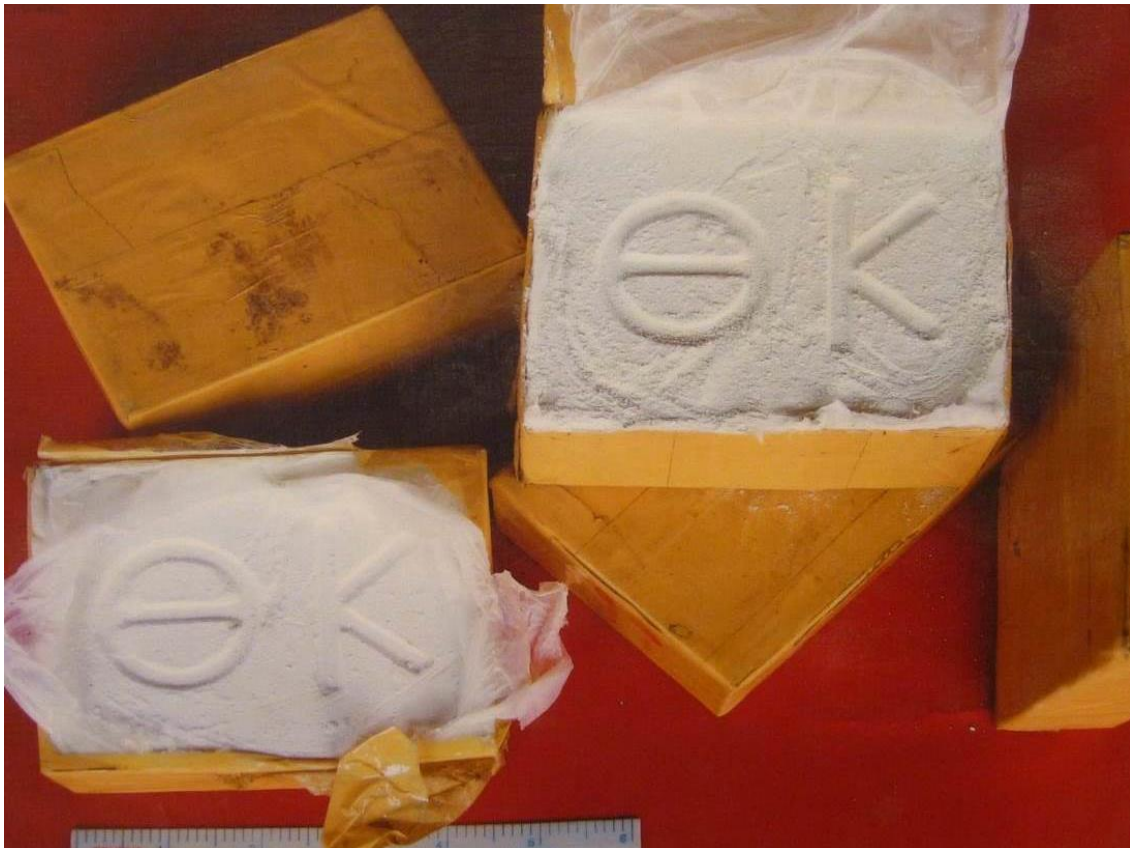
Photograph 1: Block of 'Number 4' (heroin). Photo provided to the author by a local research organisation, Taunggyi, January 2013.

The first of this article's three sections addresses the weaknesses in current conceptual frameworks of state building and the relationship between states and illicit practices. I propose alternative conceptual frameworks to define the state and to explain the role that illicit practices may play in processes of state consolidation. Section 2 contains a detailed empirical analysis of the state–drug trade nexus in Shan State since 1988, showing the central importance of the Shan borderland to state consolidation and analyzing the state's interactions with the region's illicit opium/heroin trade. The research presented here draws on interviews I have conducted in Yangon and throughout Shan State and the Thai–Myanmar borderland with poppy farmers, leaders of ceasefire and non-ceasefire groups, former militia members, community-based organizations and nongovernmental organizations (NGOs), government officials, and members of the Myanmar business community during multiple field trips to Myanmar over the past four years, including a nine-month period of fieldwork between October 2012 and June 2013. The third and final section interrogates the broader implications of the state's interaction with the illicit opium/heroin trade, analyzing how this relationship has consolidated state control, albeit in ways that remain contested and are geographically uneven.