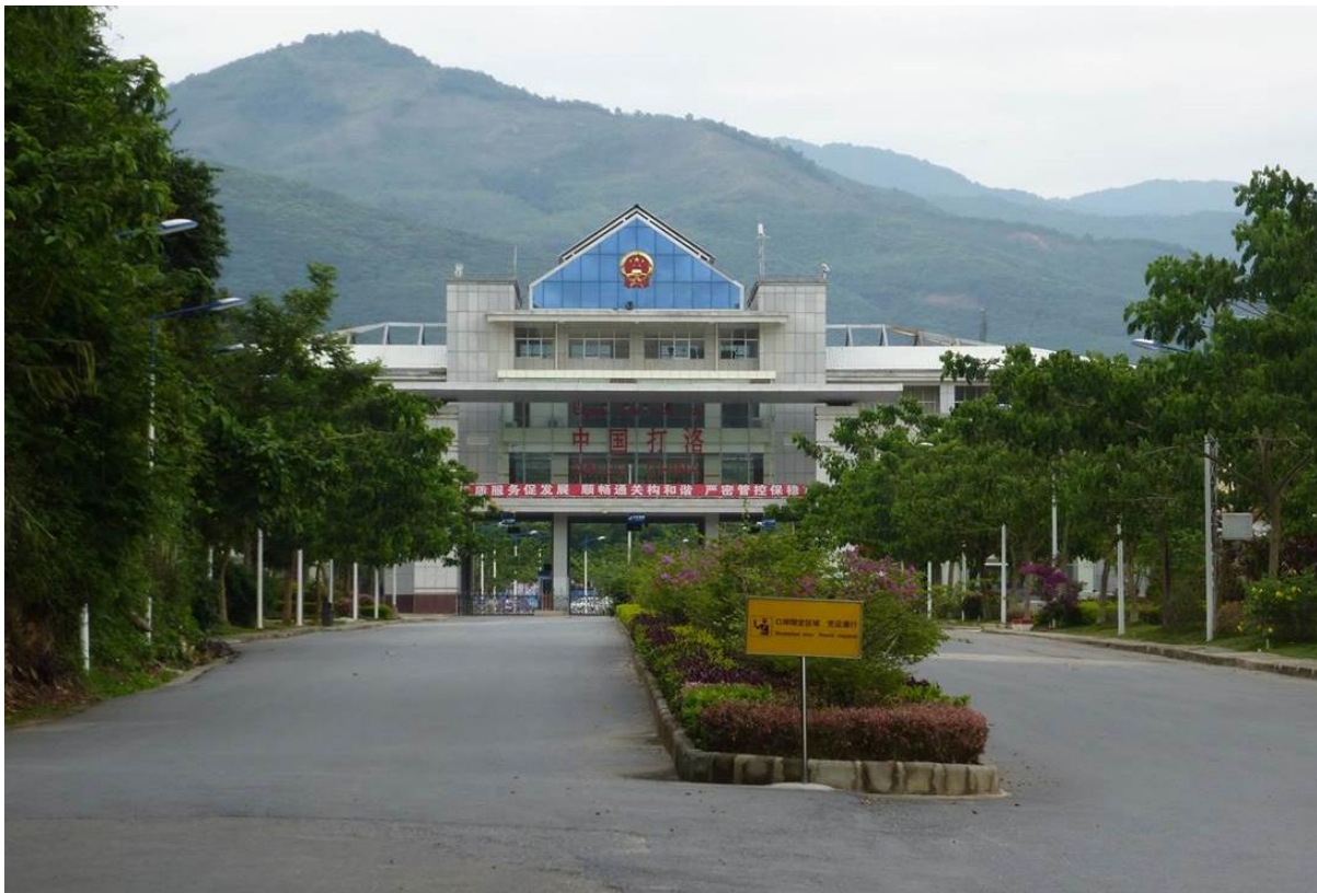
Photograph 3: Myanmar-China checkpoint in Mong La, Special Region 4. Photograph by the author, May 2013.