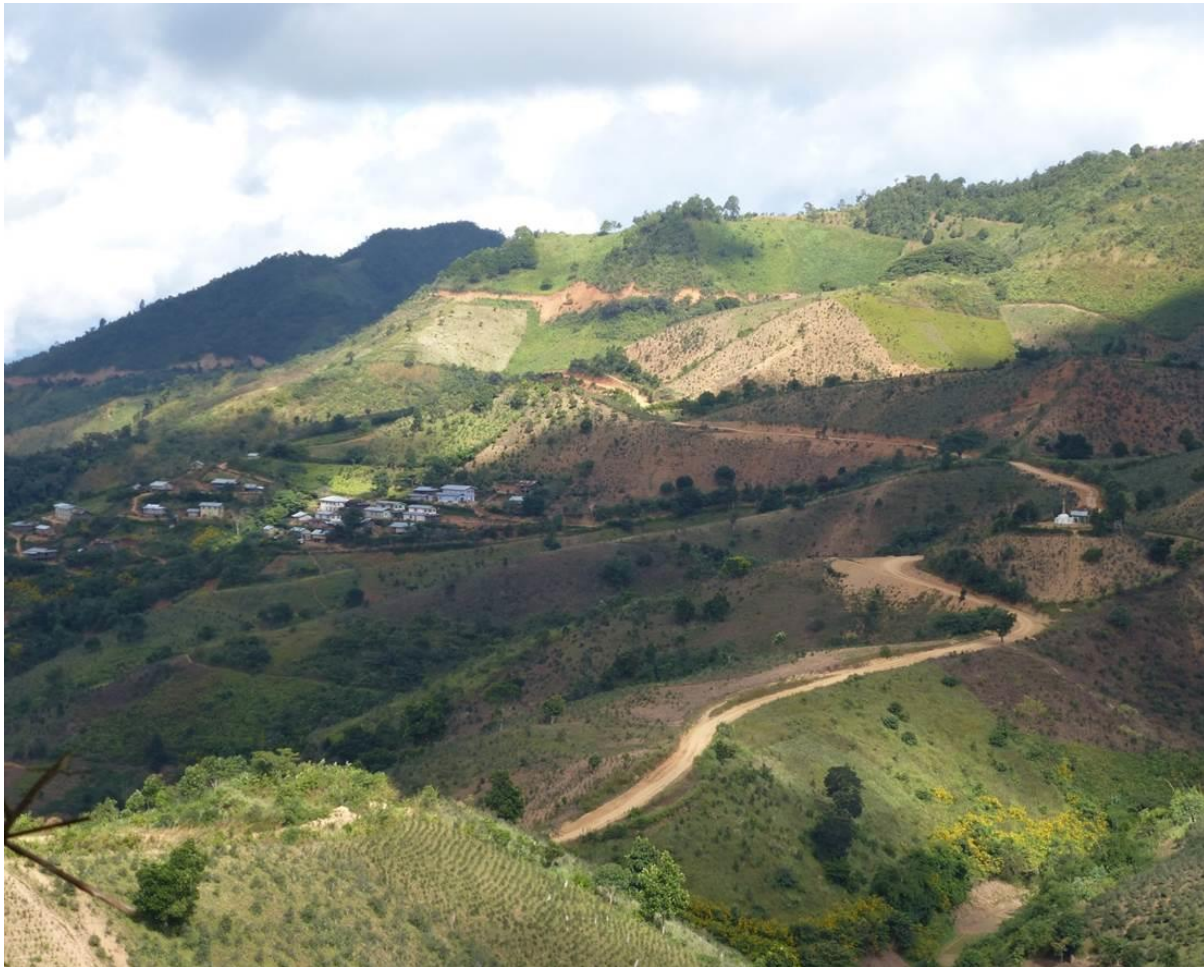
Photograph 2: Rural southern Shan State. Kalaw, December 2012.

expropriation of property, taxation, and intolerance of cultural diversity. This environment strengthened local strongmen and armed groups who proved able to hold the state at bay. By the 1980s, the Shan State borderlands were a complex “field of power” marked by intense contestation over the three power resources that govern state–society relations: a multitude of armed groups were undermining the central government’s struggle for control over the means of coercion; opium production and opposition forces’ control over the country’s flourishing black market cross-border trade created lucrative revenue streams beyond the control of the government; and ethno-nationalism and demands for a federal constitution became powerful counter-narratives to the government’s own efforts to forge popular sovereignty under a centralized unitary state.