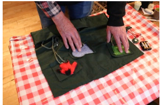
Figure 2. Artist who is blind interacting with our prototype.

The pilot sessions provided some evidence that the users engaged with the prototype and responded to the associations. The blind artist engaged actively with the prototype, triggering and experimenting with the circuits: pressing the buttons in different combinations, triggering them on and off to try to get what he called an “orchestration” (see figure 2).