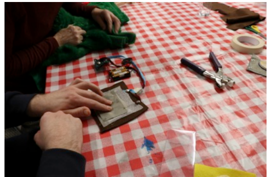
Figure 3. Participant testing their e-textile button.

The technical crafting aspects of the circuit making – building e-textile buttons and creating soft wires using the conductive thread and tube yarn – were successful, with each participant making and incorporating them into their interactive e-textile project (see figure 3).