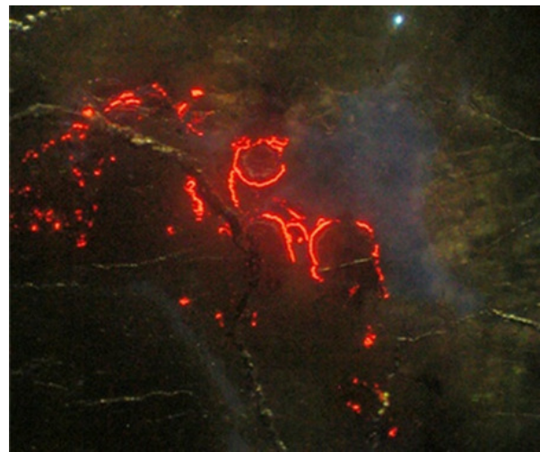
Figure 2. Cathodoluminescence image obtained of the D5 ROI in Fig. 1 (note the curved crack for further identification) using an accelerating voltage of 20-24 keV. As Fe is a typical quencher, the right red areas correspond to Fe-poor and Mn-rich carbonate layers that nicely delineate the carbonate globule walls.

determine the chemical composition of the carbonate globules. In particular, quantitative chemical analyses and BSE images of the carbonate globule walls were obtained using a JEOL JXA-8900 electron microprobe equipped with five wavelength-dispersive spectrometers at the UCM.