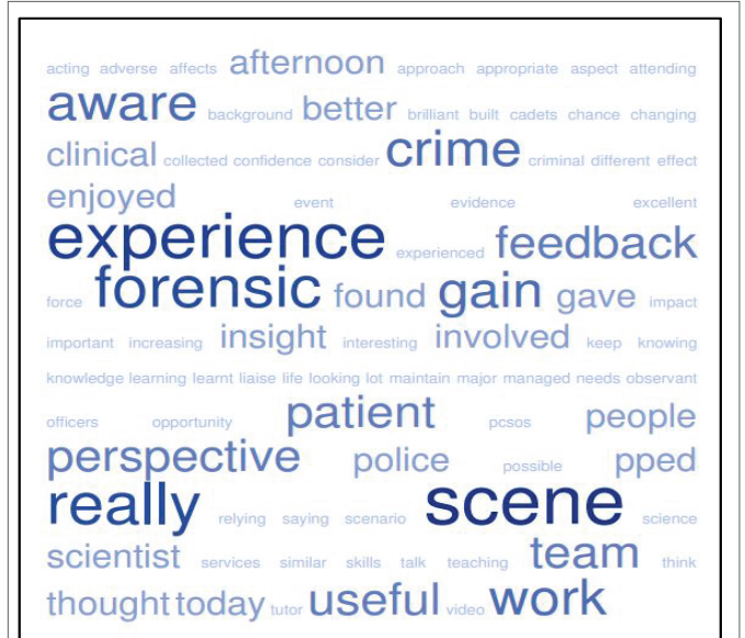
Figure 3: Word Cloud of free text feedback from participants