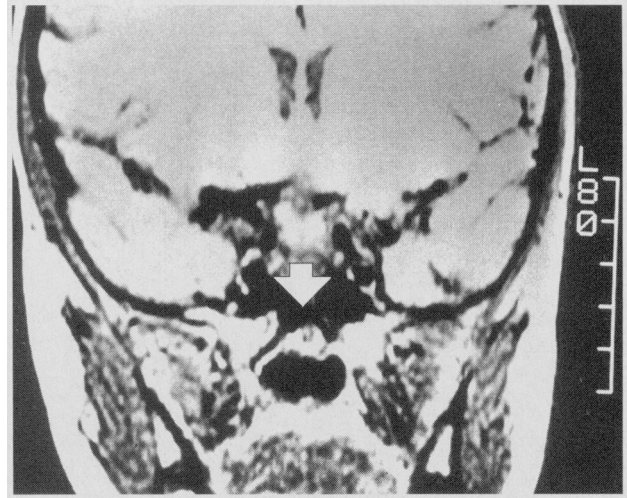
Figure 2. Coronal section of the magnetic resonance imaging scan of case 1. The arrow points to the cleft in the sellar region.