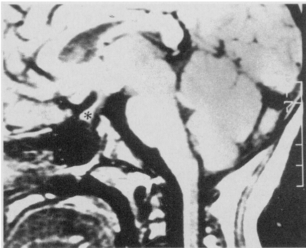
Figure 3. Sagittal section of the magnetic resonance imaging scan of case 1. The asterisk marks the pituitary gland, which is compressed by a meningocele traversing the sellar cleft.