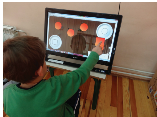
Figure 3: A child playing the “Categorize” game on a touch-screen display.

For testing our framework, the children sat at the computer table or at the classroom desk, in front of a computer. In B&H a Sony VPCL111FX/B - VAIO L Series All-in-One 24” Touch-Screen Desktop PC was used, Figure 3. In Italy and USA, a 17 inch iMAC desktop and Mac Book Pro, 13 inches laptop were used. A teacher, collecting data using a data collection sheet was present at all times.