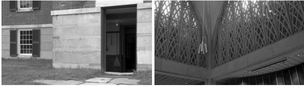
Figure 3: Two extreme case images: HancockKitchenOutside (CSR=89.837; MOS=32.200)(left) contains a light bulb with a very bright but very small area; and URChapel(2)_middle (CSR=89.548; MOS=33.150)(right) which contains many very small areas with extremely low pixel values.