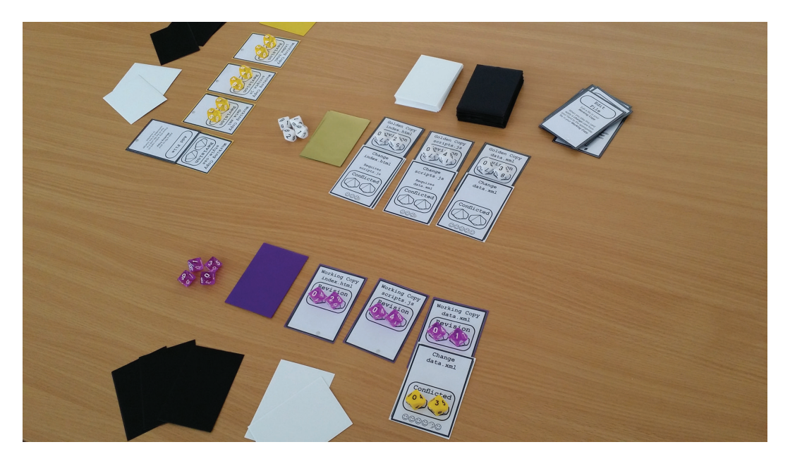
Figure 3. Check It Out! being played

effect of this blocking behaviour was that the time taken to play a game was extended and became unpredictable, so the decision was made to make the game a cooperative one. This demonstrates the potential detrimental effect that undesirable emergent behaviour could have on students achieving learning outcomes.