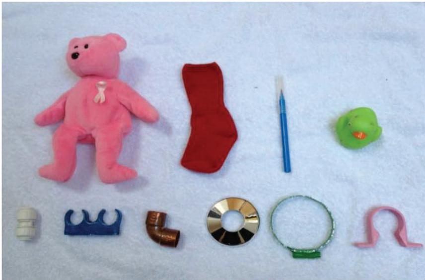
FIGURE 1 | Exposure Array and Comprehension Test Array. From top, left to right: pink teddy, red sock, blue pen, green duck, white connector, blue double pipe clip, copper elbow, chrome pipe collar, green hose clip and pink pipe clip.