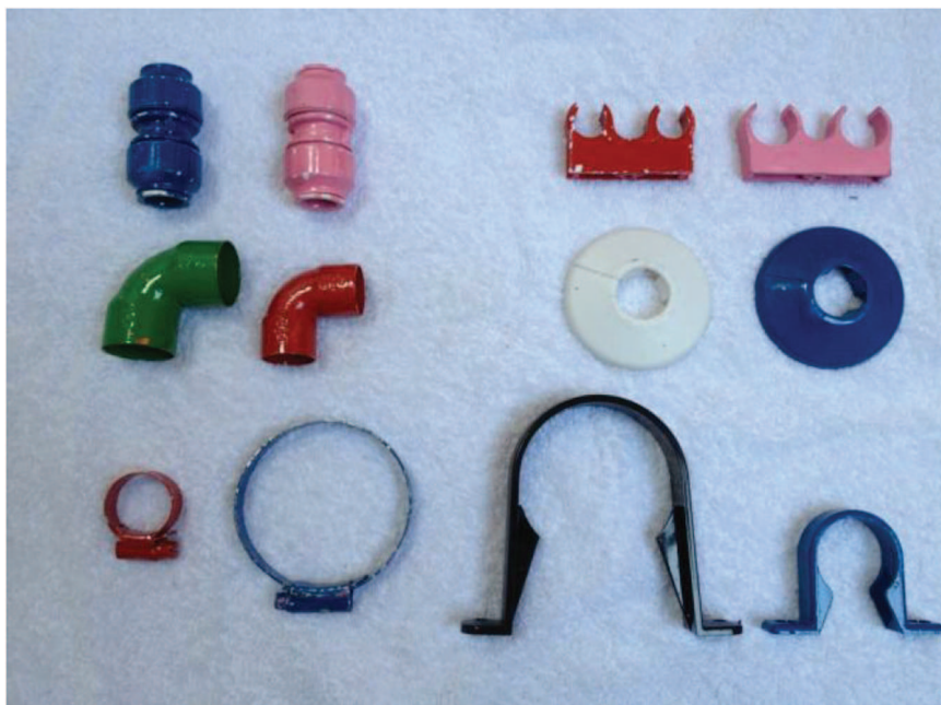
FIGURE 2 | Extension Array. From top, left to right (six pairs): blue connector and pink connector; red double pipe clip and pink double pipe clip; green elbow and red elbow; white pipe collar and blue pipe collar; red hose clip and blue hose clip; black pipe clip and blue pipe clip.