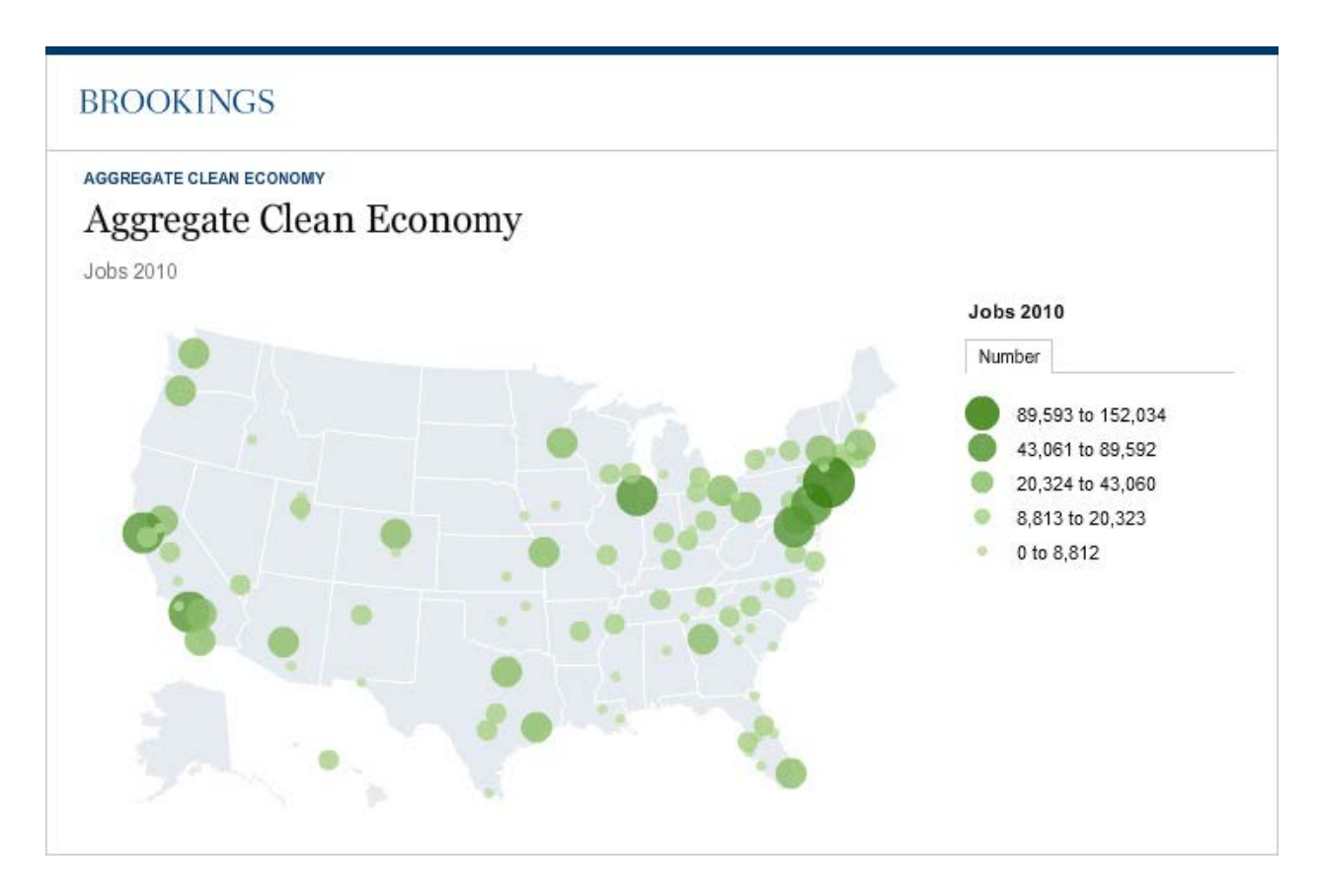
Figure 1. Aggregate Clean Economy by Metropolitan Area by Job Numbers.