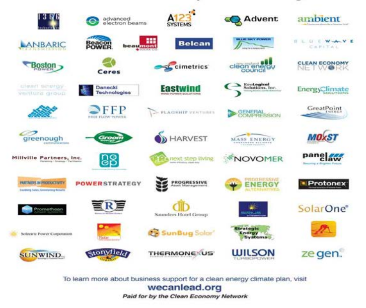
Figure 3: Advertisement in the Boston Globe by Massachusetts Clean Economy Network, 2010.

Massachusetts businesses are ready to lead if Washington will act.