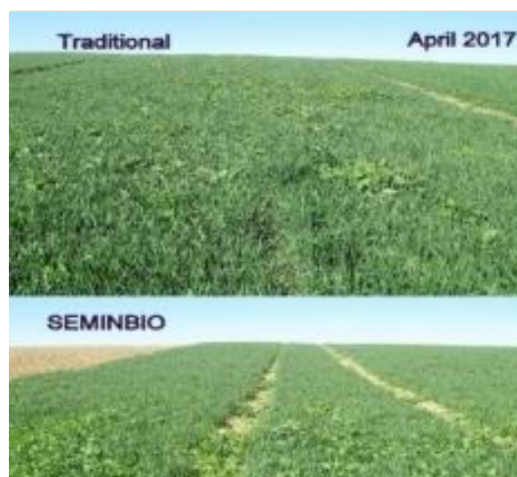
Figure 3: Comparison between traditional sowing layout (above) and SEMINBIO® layout (below).