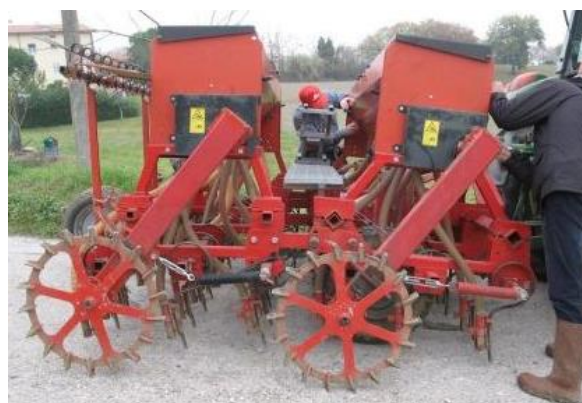
Figure 1: The Seminbio® seeder (Photo: Carlo Ponzio, CONMARCHEBIO).