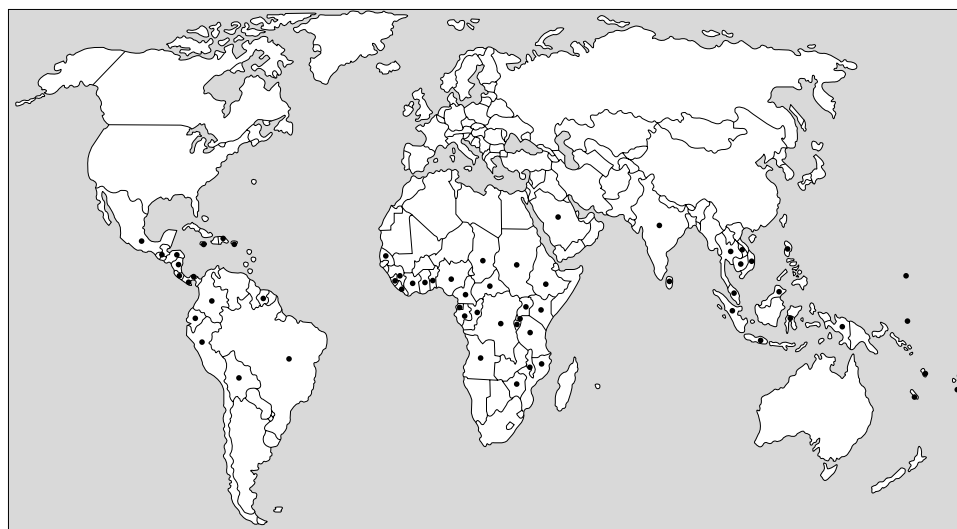
Fig. 1. Countries with known records of Hypothenemus hampei . Note: dots do not indicate the precise location where the pest was initially recorded or its present area of distribution within the respective countries.