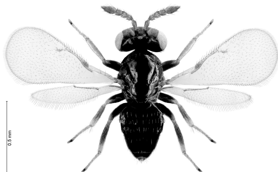
Fig. 3. Female Phymastichus coffea .