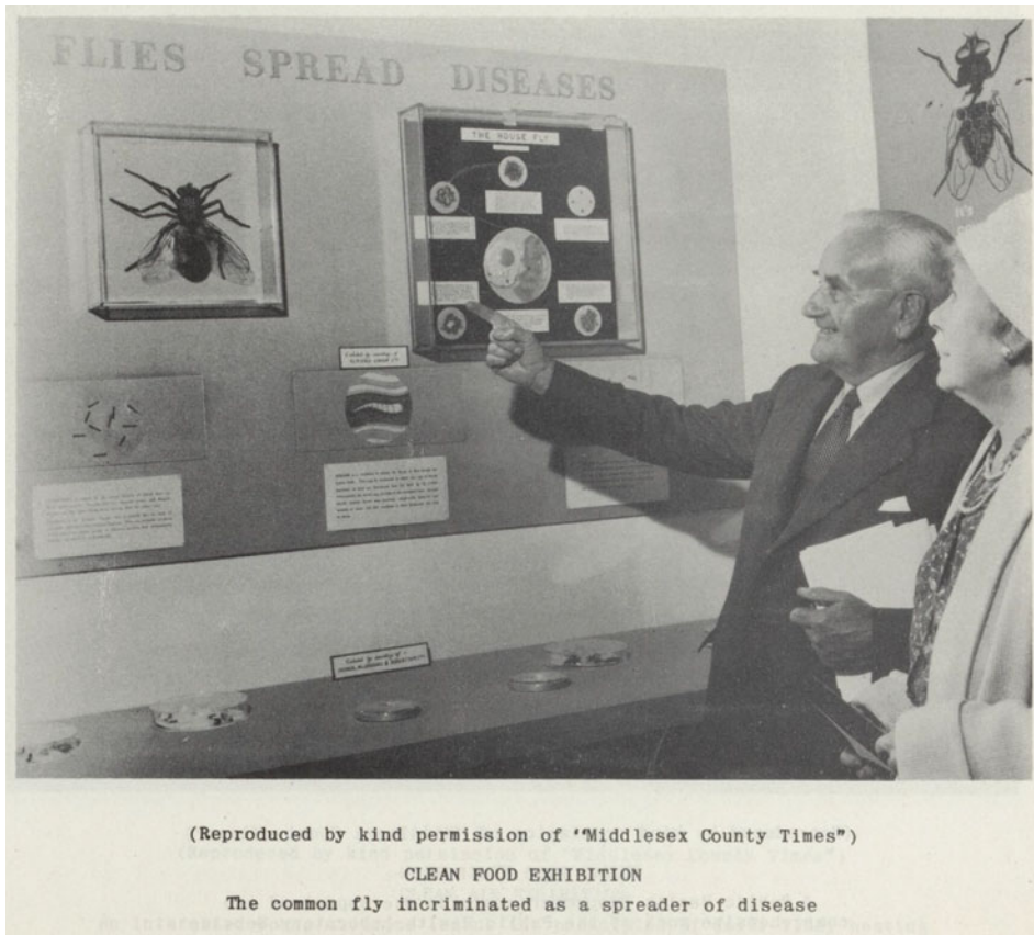
Figure 6: Photograph of exhibition organised by MOH for Ealing, 1961: The common fly as a spreader of disease. Source: Report of the Medical Office of Health for Ealing, 1961. No page number. Permission: Licenced under Creative Commons Attribution 4.0 International Licence.

health. The introduction of sewers, clean water and drainage during the nineteenth century resulted in the removal of one kind of environmental cause of ill-health, but air pollution was still a concern. Following the Great Smog in 1952, the Clean Air Act was introduced in 1956. The Act required those living in smoke control areas (which included all of London) to burn smokeless fuels in their homes. 49 MOsH exhibitions after 1956 often dealt with the issue of clean air, sometimes collaborating with utility providers and commercial enterprises to demonstrate the use of smokeless fuels and appliances (Figure 7). Indeed, the MOsH appeared to have been increasingly concerned with what went on in homes, and not just in relation to food hygiene in kitchens, or the burning of smokeless fuels in living rooms. Safety in the home, and the prevention of domestic accidents was an increasingly common theme of exhibitions during the mid-1950s and early 1960s. Some MOsH went to considerable effort to get the message across. In 1951 the MOH for Woolwich exhibited