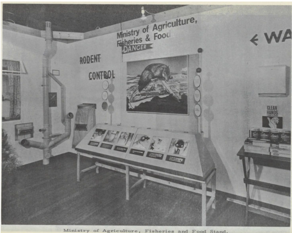
Figure 5: Photograph of exhibition organised by MOH for Hampstead, 1962, with a prominent image of a rat. Source: Report of the Medical Office of Health for Hampstead, 1962. No page number. Permission: Licenced under Creative Commons Attribution 4.0 International Licence.

Yet, food hygiene was not the only existing danger to public health that assumed new importance in the post-war era. The environment had long been thought to pose a threat to