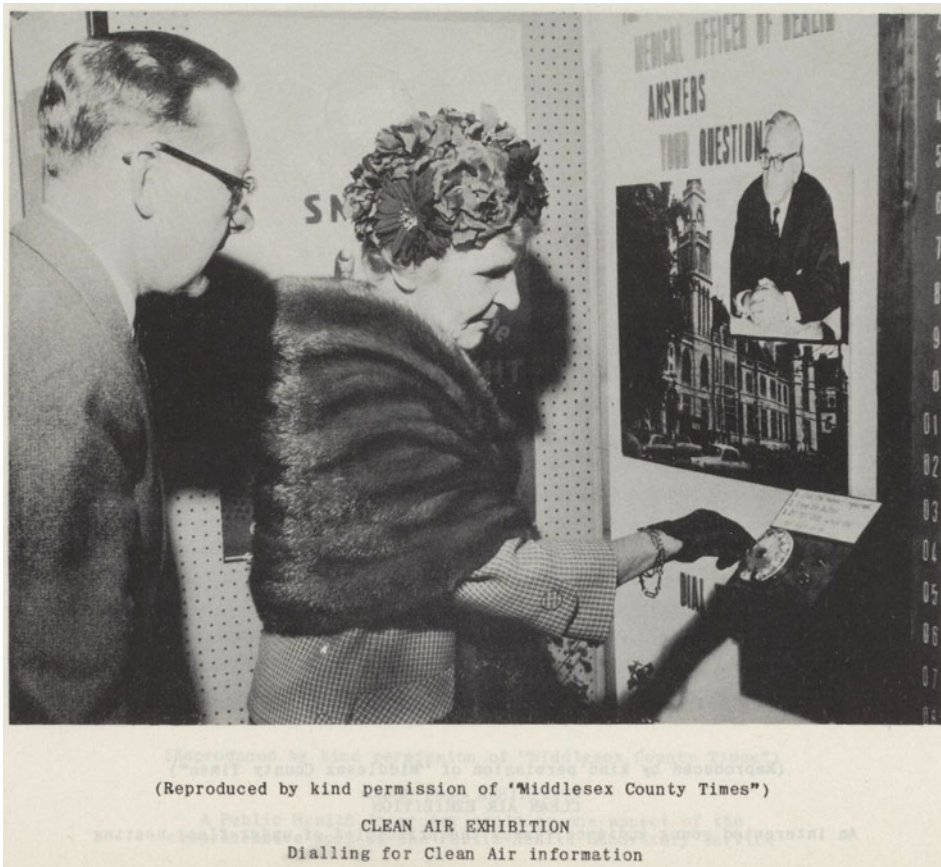
Figure 8: Photograph of automatic question and answer device used in exhibition organised by MOH for Ealing, 1961. Report of the Medical Officer of Health for Ealing. Permission: Licenced under Creative Commons Attribution 4.0 International Licence.

have singularly little effect upon the public'. 113 In contrast, television programmes were regarded by survey respondents as the most effective form of health education, followed by films, talks in schools, and radio programmes. This led Chalke to conclude that 'it would seem that since the public are responsive to instruction by television, health magazines, and modern commercial advertising, a great deal more use should be made of them'. In particular, 'The popularity of television as a health educational medium cannot be overlooked; it must surely serve as a guide to future activities in health promotion.' 114