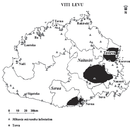
Figure 1. A map of Viti Levu, Fiji, showing M. micrantha infestations (each >4.0 m 2 in area) and areas (shaded) covered in the field study.

Data analysis Mikania micrantha densities were square root transformed to improve normality and variance homogeneity. Comparisons between provinces and farms were conducted using a two-way ANOVA while comparisons within farms were conducted using a one-way ANOVA. Genstat was used for analysis.